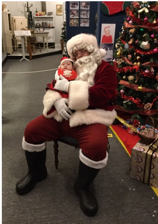
Cocoa and Cookies with Santa

To make awareness and appreciation of local heritage an integral part of the community's life by offering excellent service and quality programmes.