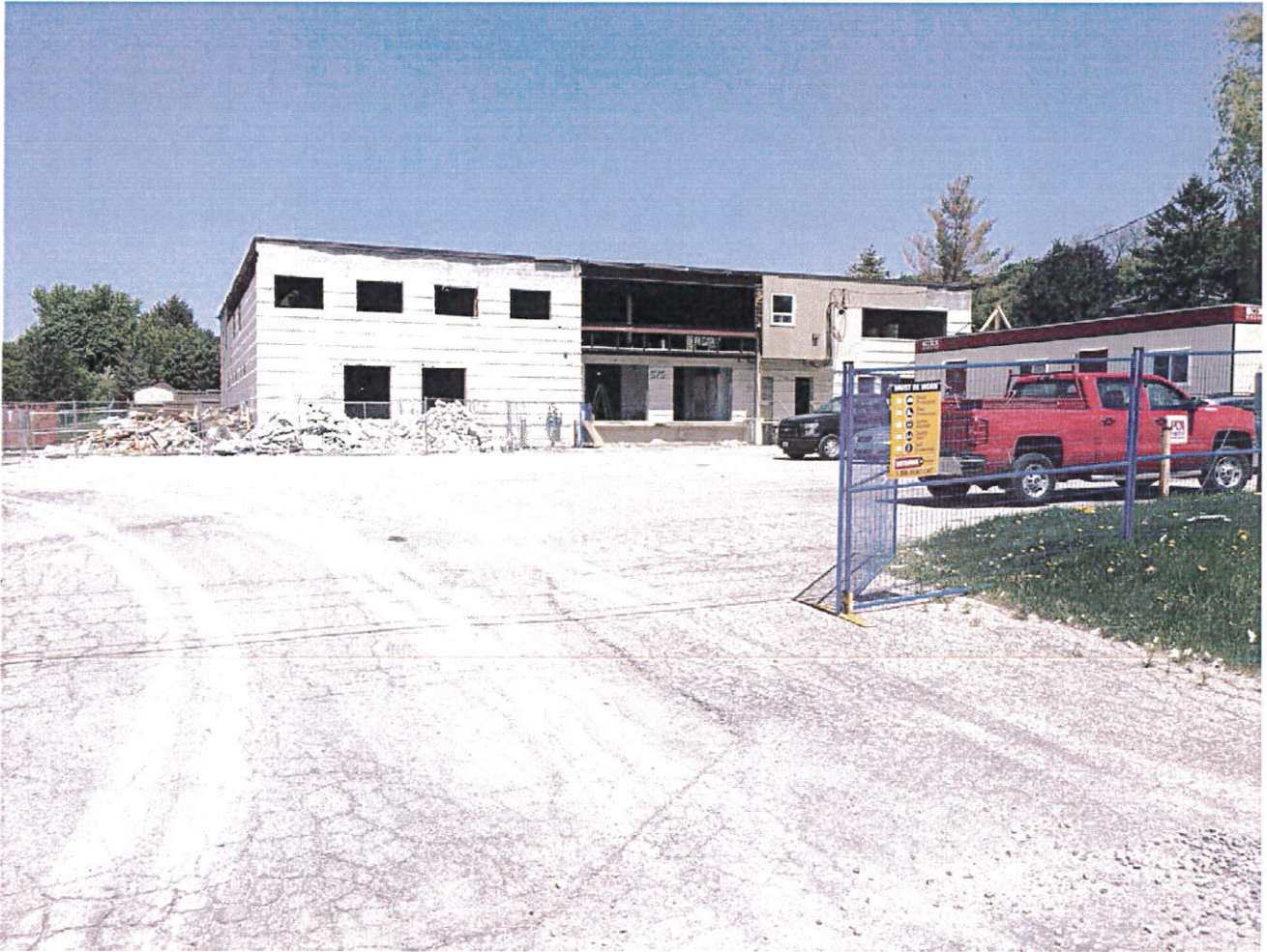
New human services agency use (Community Living Central York) under renovation at 575 Penrose Street (north west of Mulock Drive and Bayview Avenue)