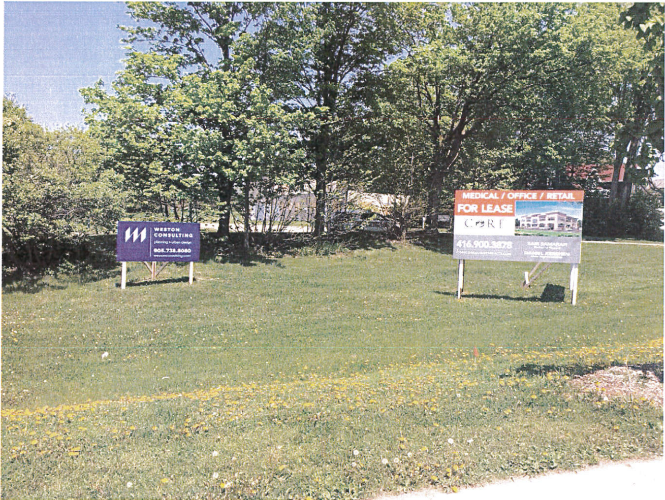
Proposed medical services/office/retail use at 507 Mulock Drive (northwest of Mulock Drive and Bayview Avenue)