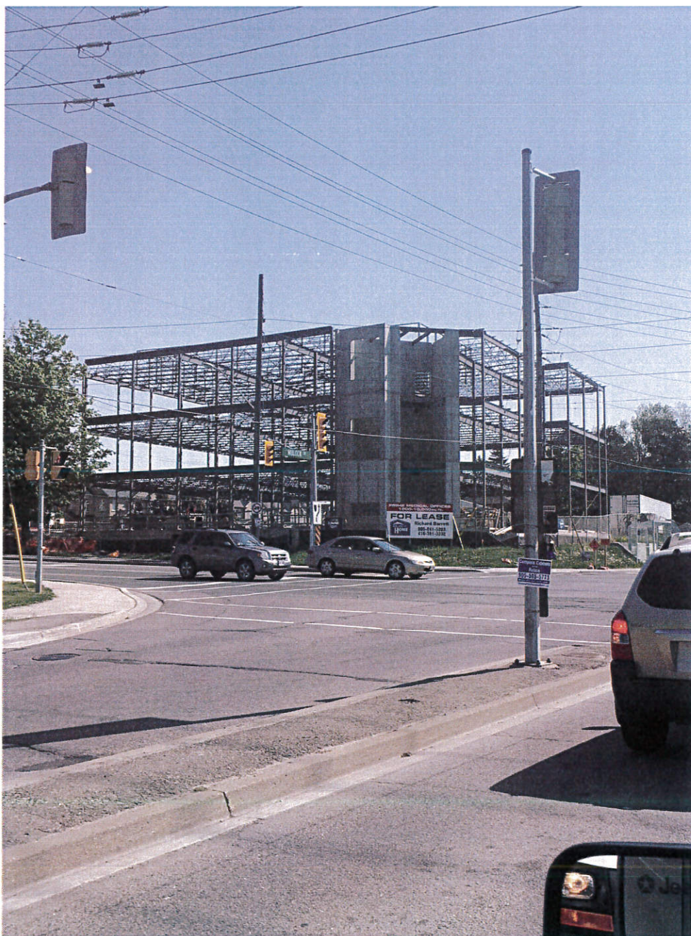
New medical services/offices use under construction at 536 Mulock Drive (north east corner of Mulock Drive and Bayview Avenue)