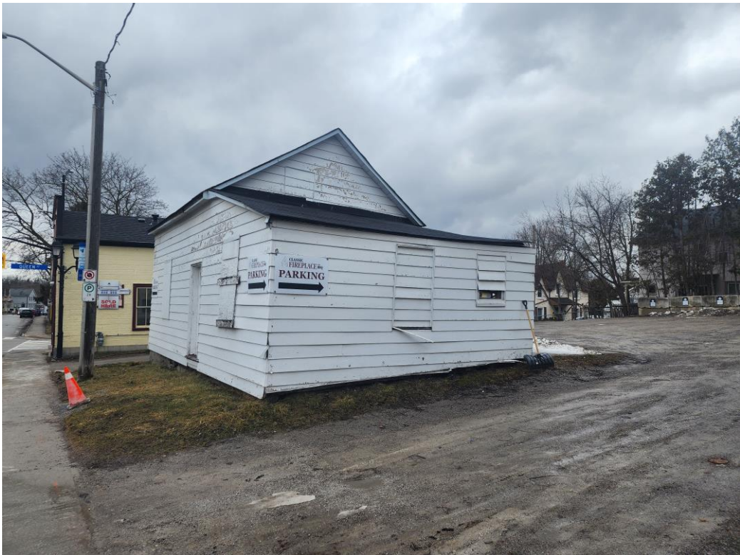
Southwest corner of 95 Main Street South

Demolition Request of Building Addressed 95 Main Street South