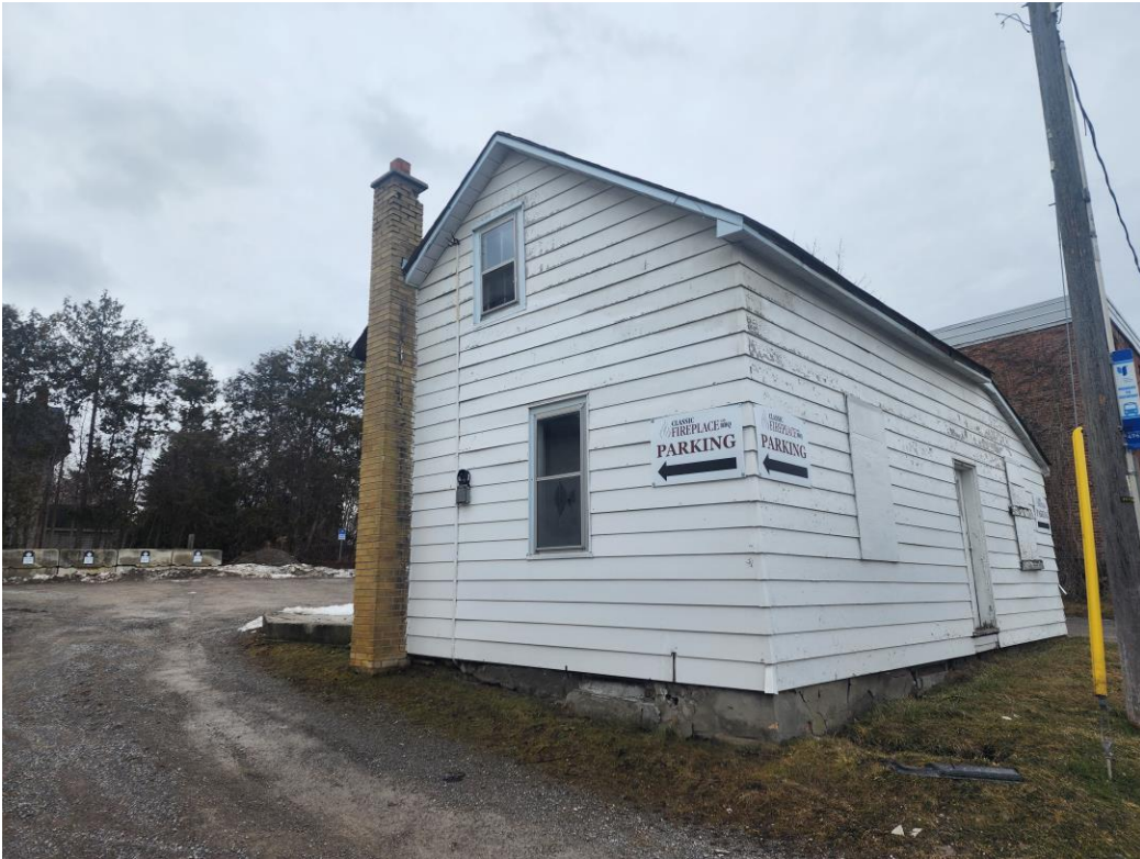
Northwest corner of 95 Main Street South