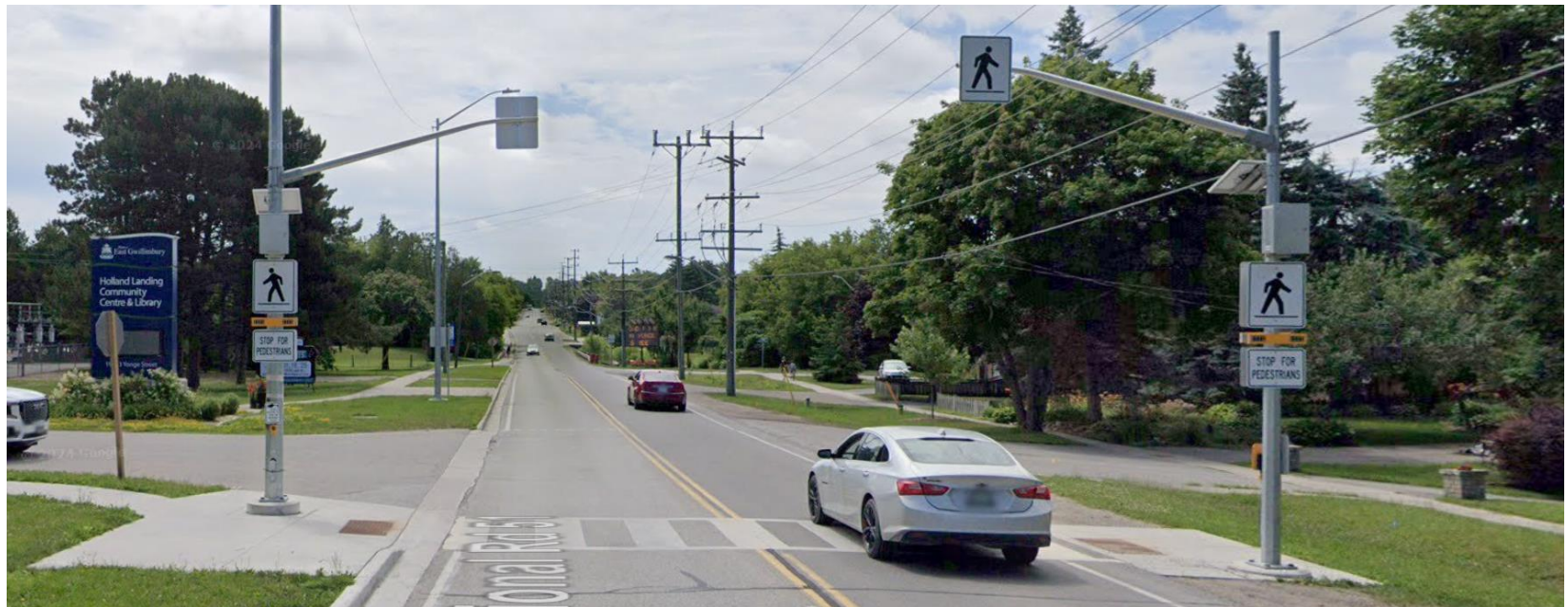
Example of Type B PXO: York Region (EG)

A controlled pedestrian crossing regulated under Ontario Regulation 402/15 of the Highway Traffic Act.