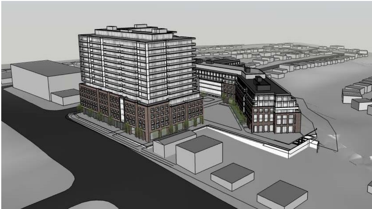
Figure 2b View looking northwest from Davis Drive.