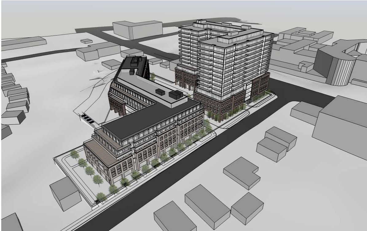
Figure 2a View looking south-east from Bolton Avenue.

Figures 2a and 2b below show a conceptual rendering of the buildings.