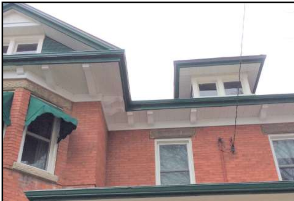
Image 2: Detail of Façade at 379 Botsford (Photo taken on April 7, 2016; Facing North)