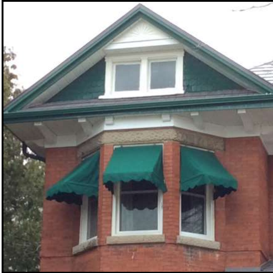
Image 3: Detail of Pediment and Bay on Façade of 379 Botsford Drive (Photo taken on April 7, 2016; Facing North)