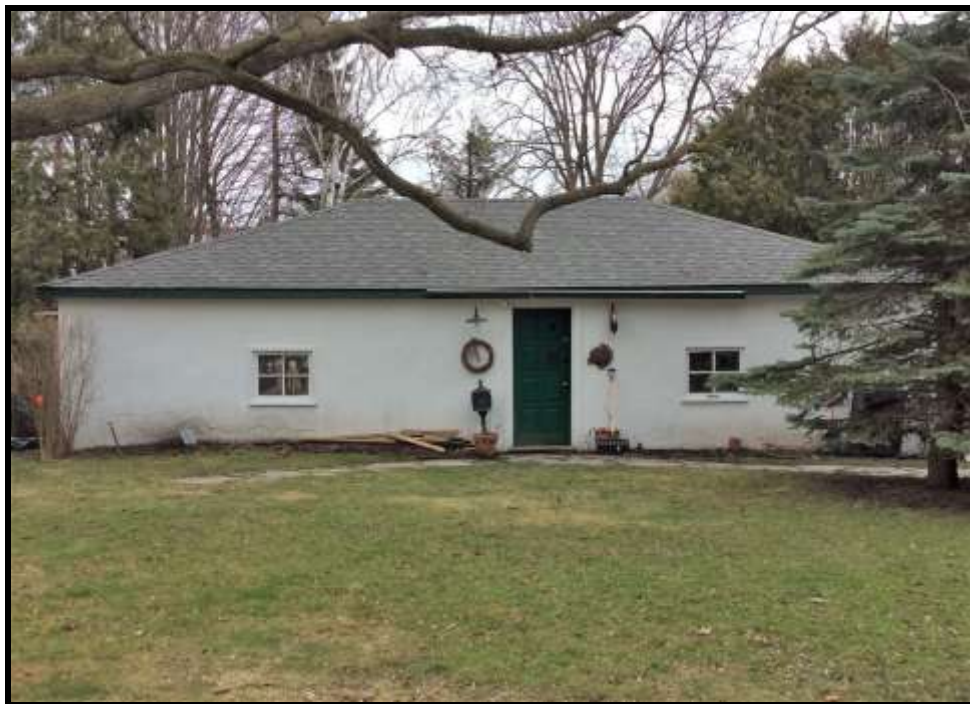
Image 16: West Elevation of Garage (Photo taken on April 7, 2016; Facing East)