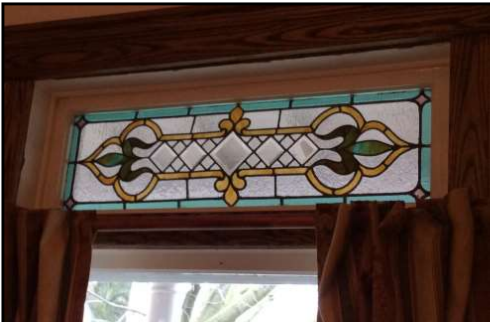
Image 6: Interior View of Stained Glass Transom on Façade at 379 Botsford Drive (Photo taken on April 7, 2016; Facing South)