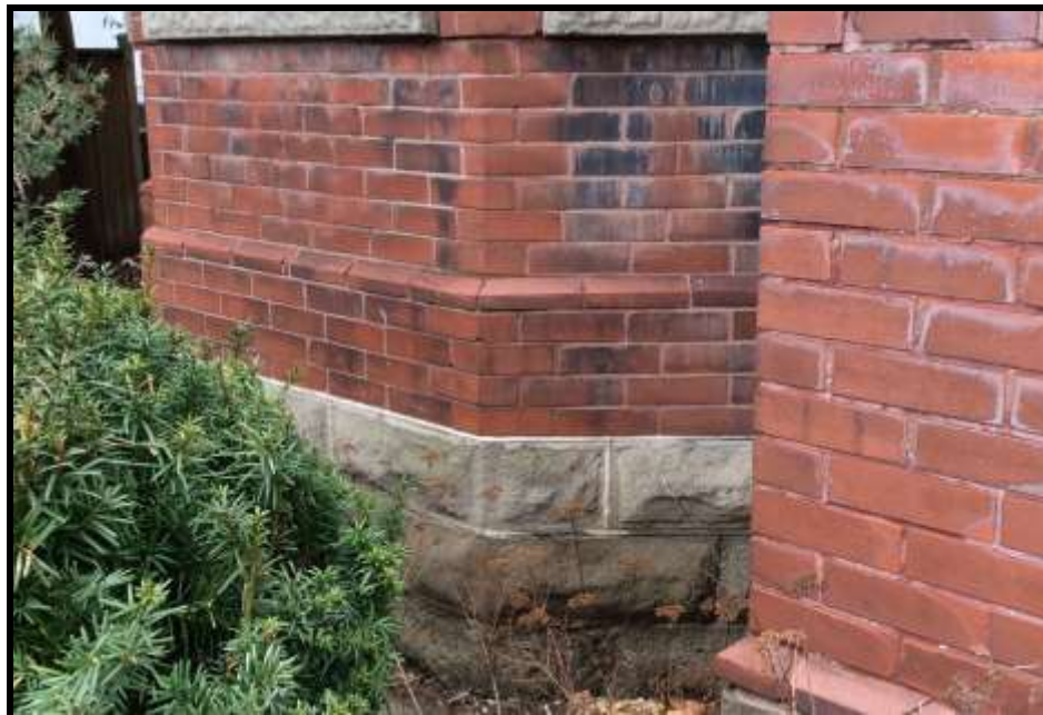
Image 4: Detail of Cut-stone Foundation (Photo taken on April 7, 2016; Facing West)