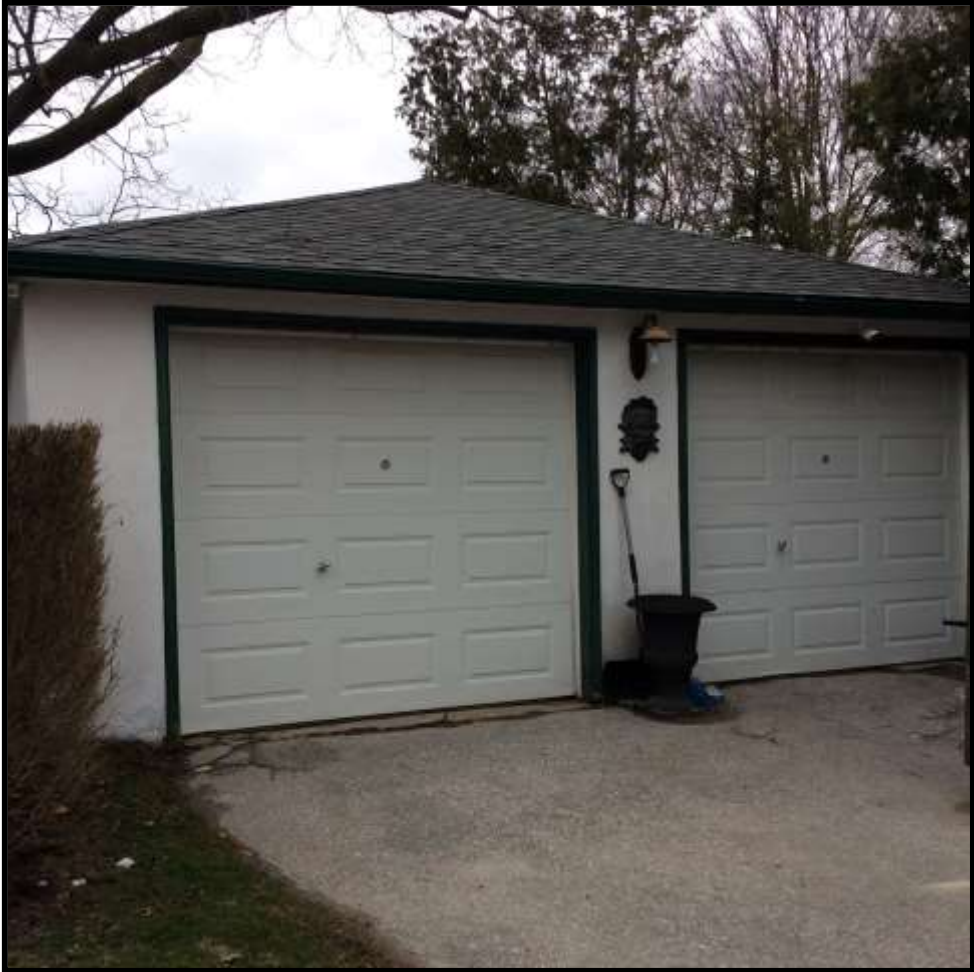
Image 17: South Elevation of Garage (Photo taken on April 7, 2016; Facing Northeast)