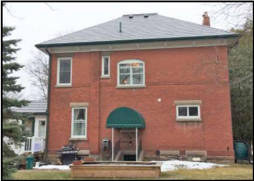
Image 11: North (Rear) Elevation (Photo taken on April 7, 2016; Facing South)