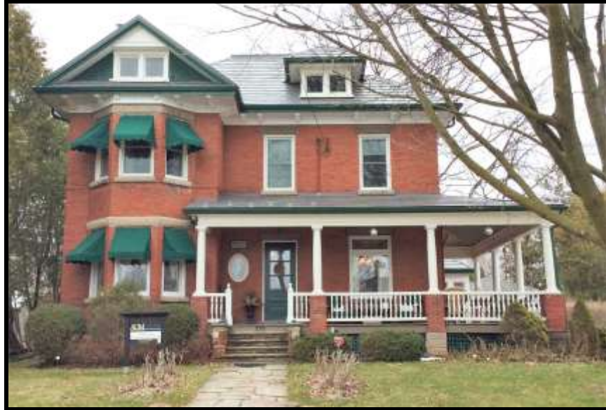
Image 1: Façade of Property at 379 Botsford Drive (Photo taken on April 7, 2016; Facing North)