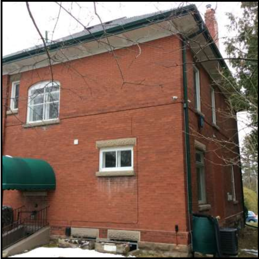
Image 10: North and West Elevations (Photo taken on April 7, 2016; Facing Southeast)