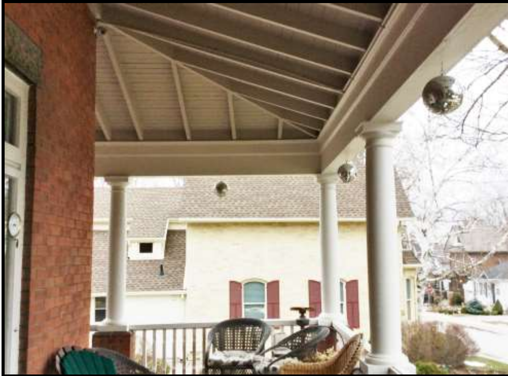
Image 5: Covered Porch on Façade at 379 Botsford Drive (Photo taken on April 7, 2016; Facing East)