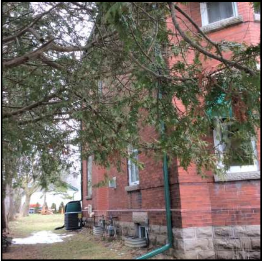
Image 9: View of West Elevation (Photo taken on April 7, 2016; Facing Northeast)