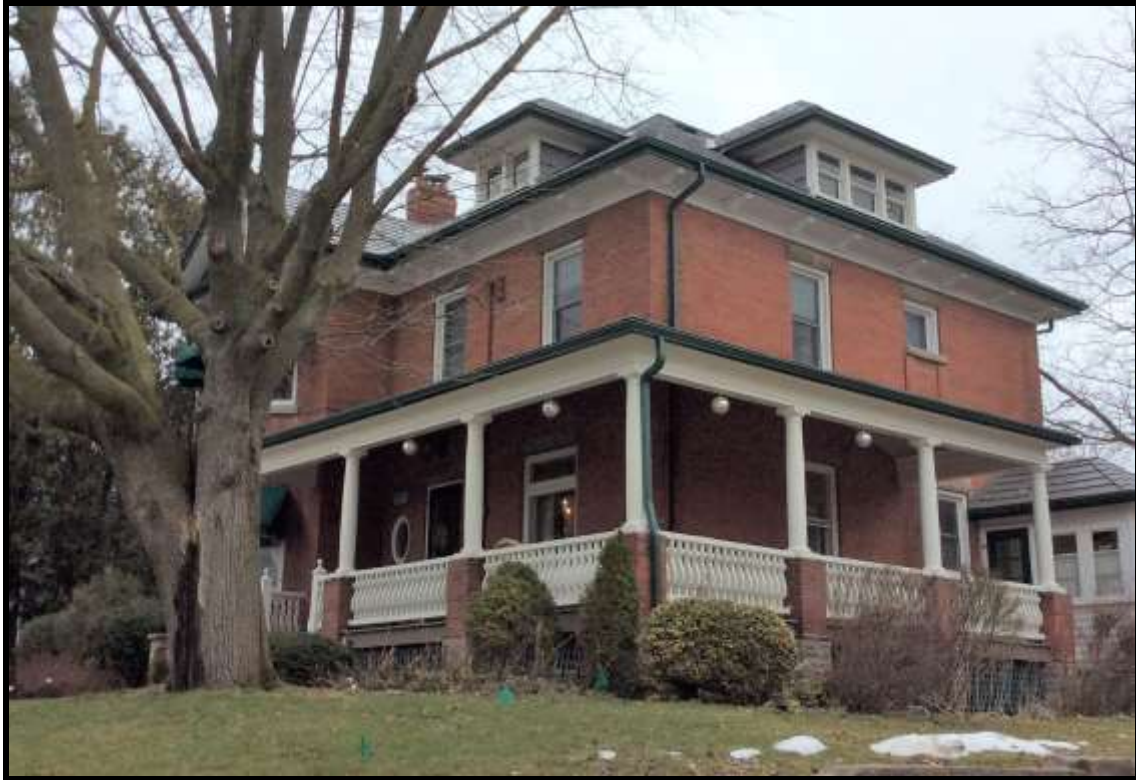
Image 15: East Elevation and Façade of 379 Botsford Drive (Photo taken on April 7, 2016; Facing Northwest)