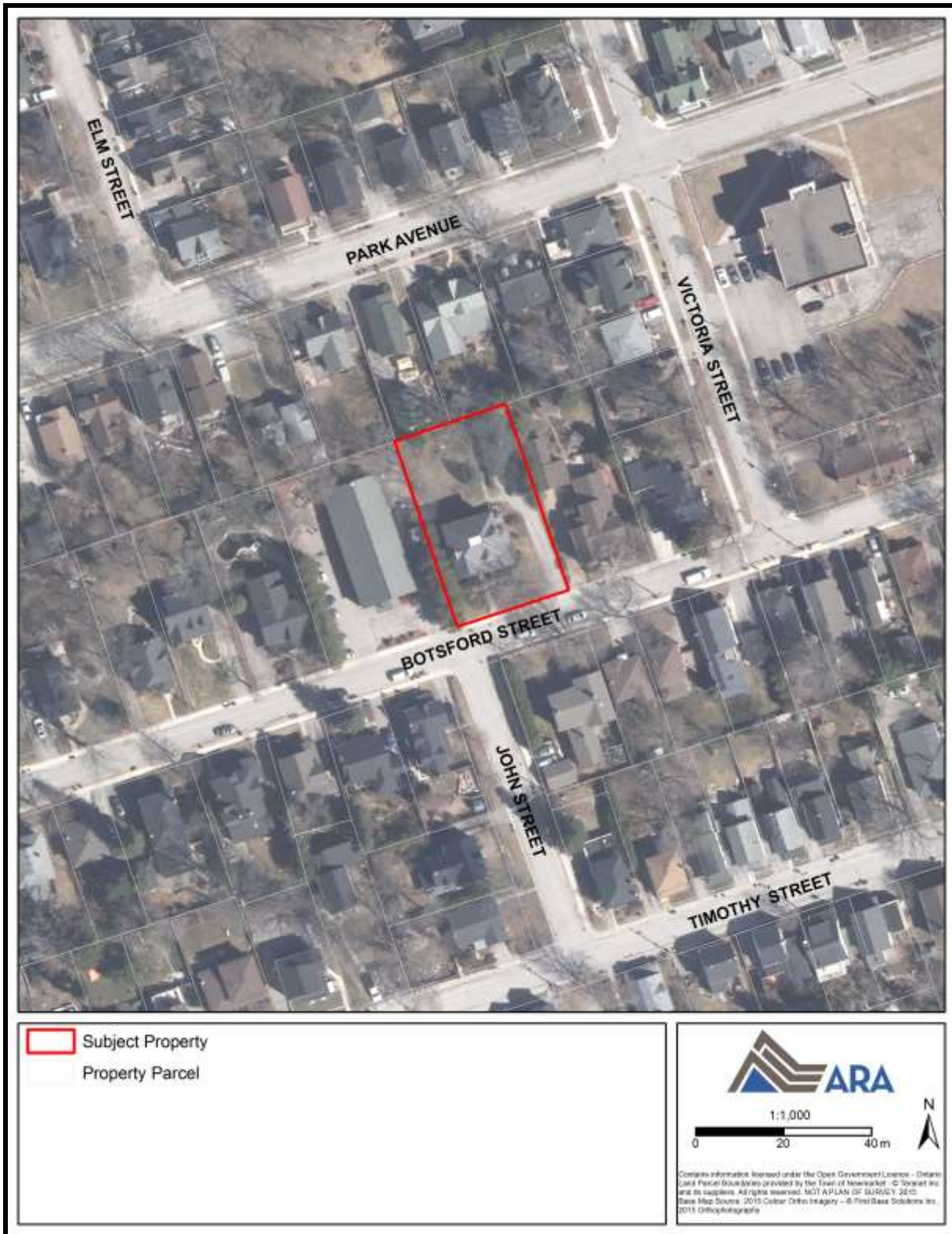
Map 1: Location of the Property at 379 Botsford Drive (Queens Printer for Ontario 2016)