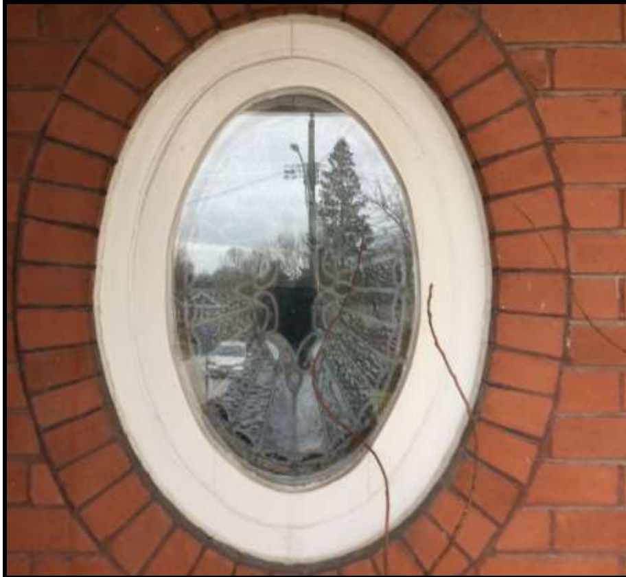
Image 7: Oval Stained Glass Window on Façade at 379 Botsford Drive (Photo taken on April 7, 2016; Facing North)