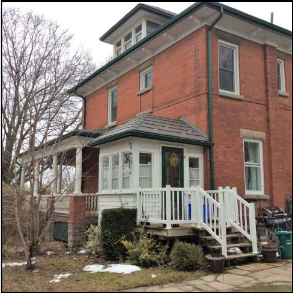
Image 14: North and East Elevations of 379 Botsford Drive (Photo taken on April 7, 2016; Facing Southwest)