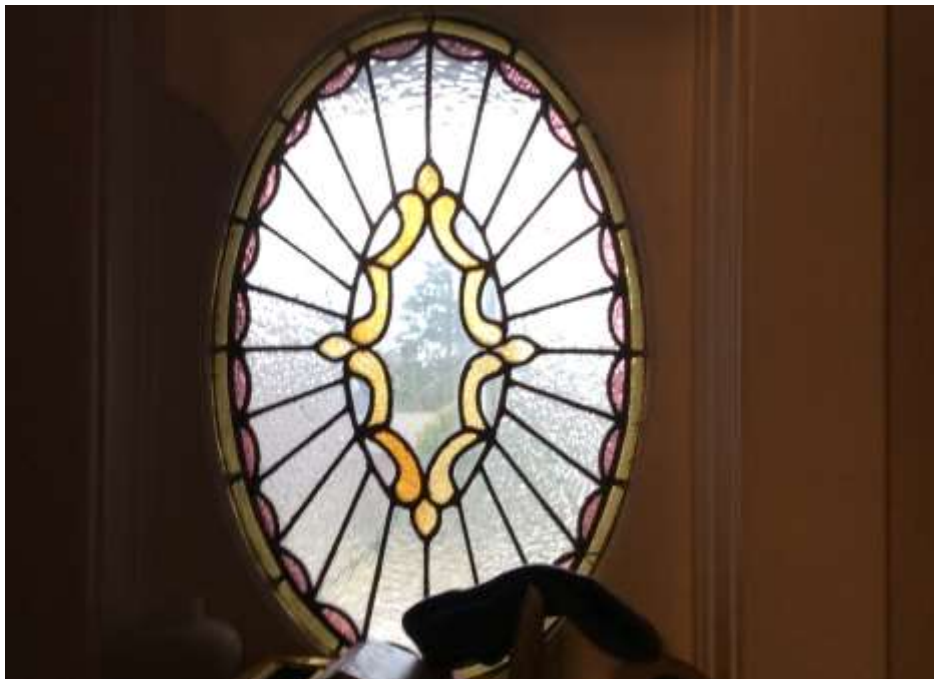
Image 8: Interior View of Oval Stained Glass Window (Photo taken on April 7, 2016; Facing South)