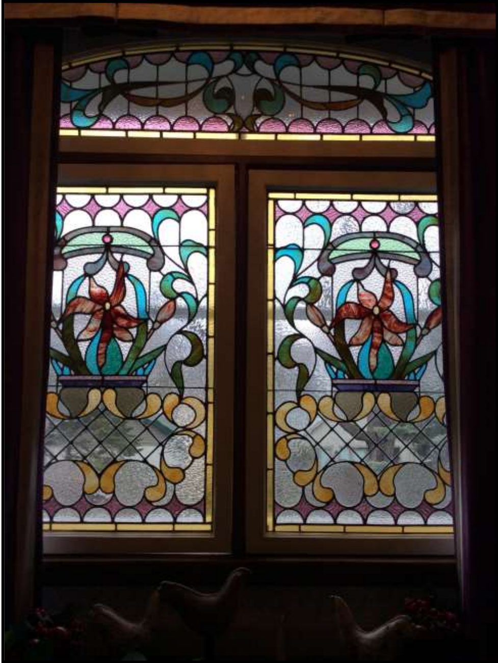
Image 13: Stained Glass from Interior at Second Storey Landing (Photo taken on April 7, 2016; Facing North)