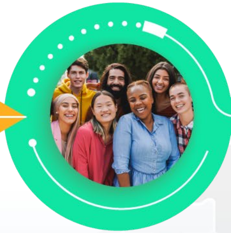
A Vibrant, Diverse and Accessible Community