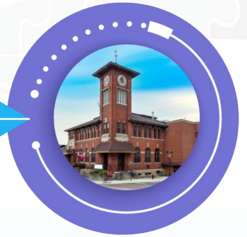
A Place to Be and Visit