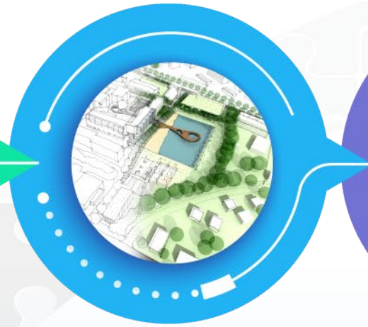
A Complete Community