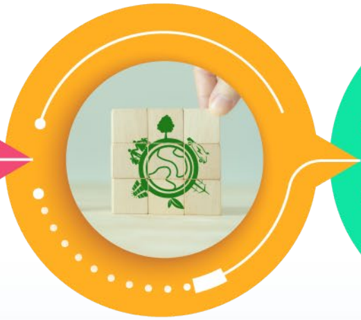
A Green and Resilient Community