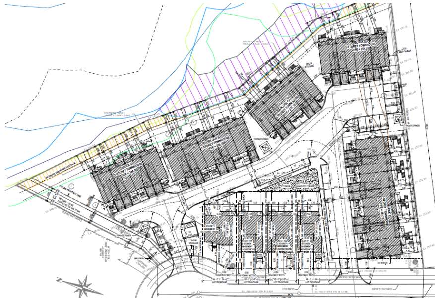
Figure 2 – Concept Site Plan

Each dwelling unit includes private amenity space in the form of private rear yards. In addition, the townhouses have balconies in the rear and at the front of the units. The townhouse blocks either back onto the Town-owned open space on the east side or the Newmarket High School field on the south side.