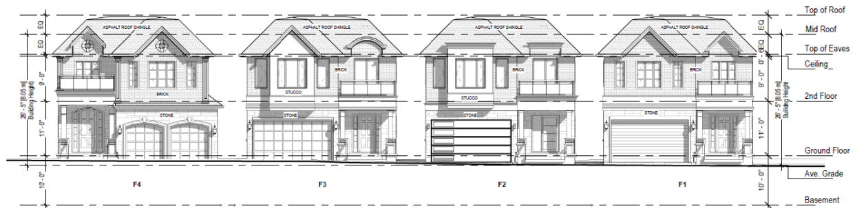
Figure 3 – Elevations of the proposed single detached dwellings on Pickering Crescent

The proposal is comprised of single detached and townhouse units. The surrounding area is comprised of similar building types. The proposed single detached and townhouse dwellings are compatible with the existing neighbourhood and due to the consistent land use and house typology, impact to the existing community in minimized. The proposal is surrounded predominantly by open space to the north and east. The lands to the south of the subject property are associated with Newmarket High School are the field and track. The proposed single detached homes will front Pickering Crescent and maintain the existing building typology along the street.