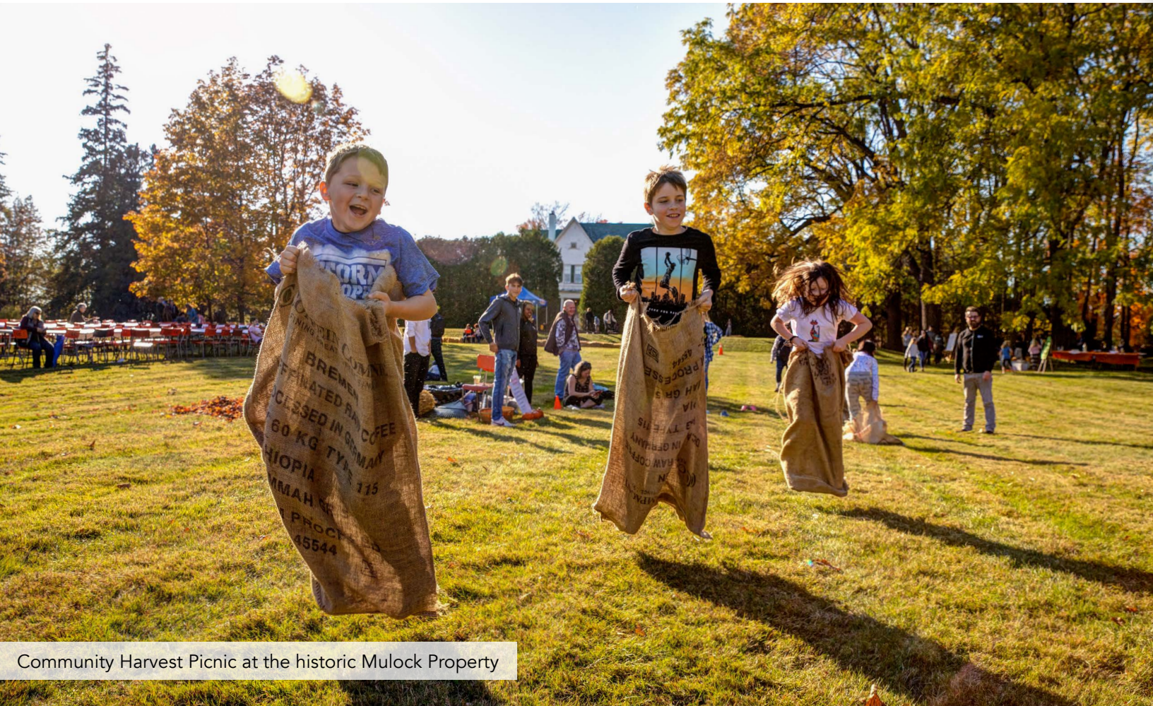
Community Harvest Picnic at the historic Mulock Property