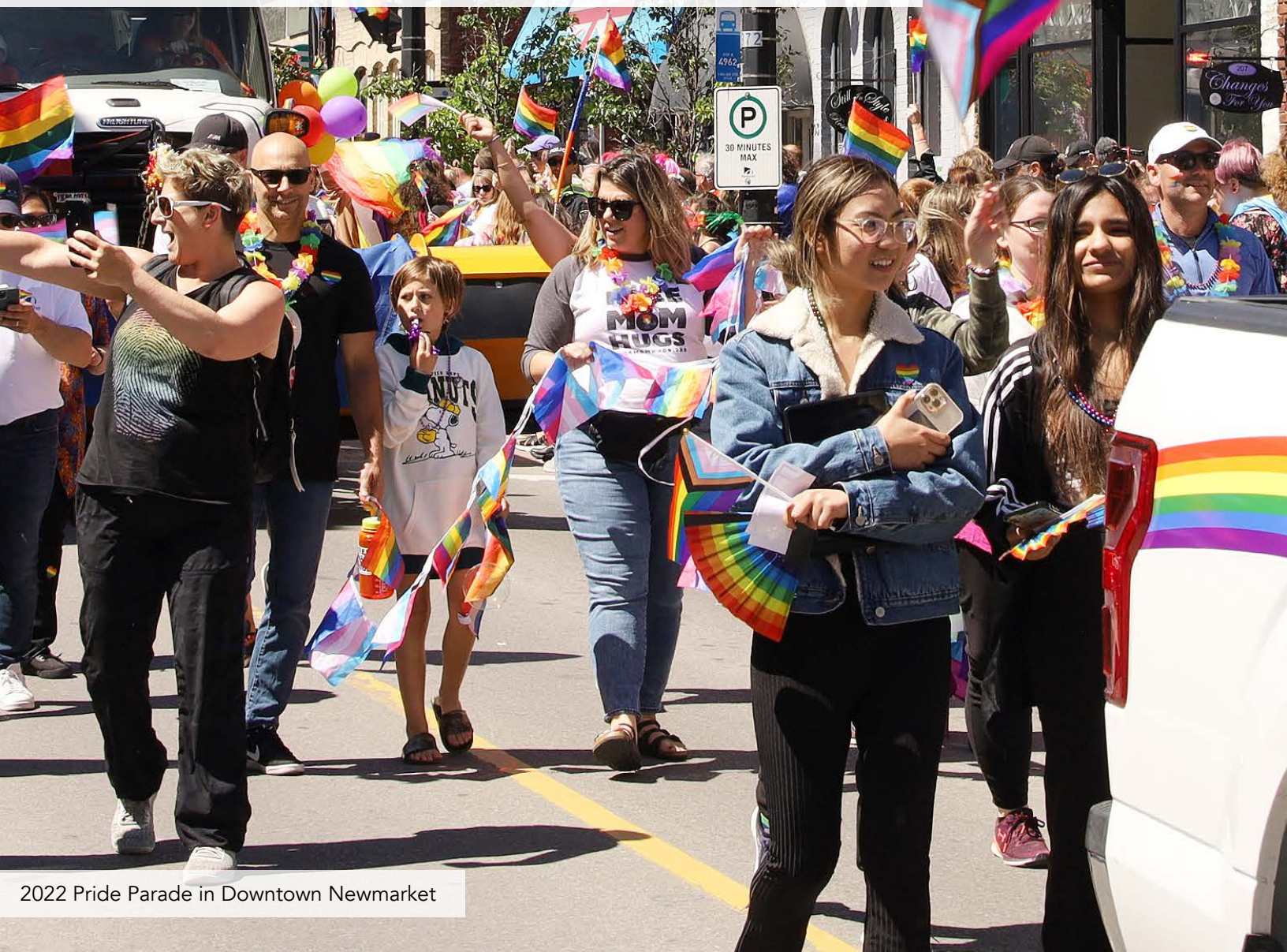
2022 Pride Parade in Downtown Newmarket

There are many more chapters to our story and we look forward to writing them together as we create a new path to our extraordinary future!