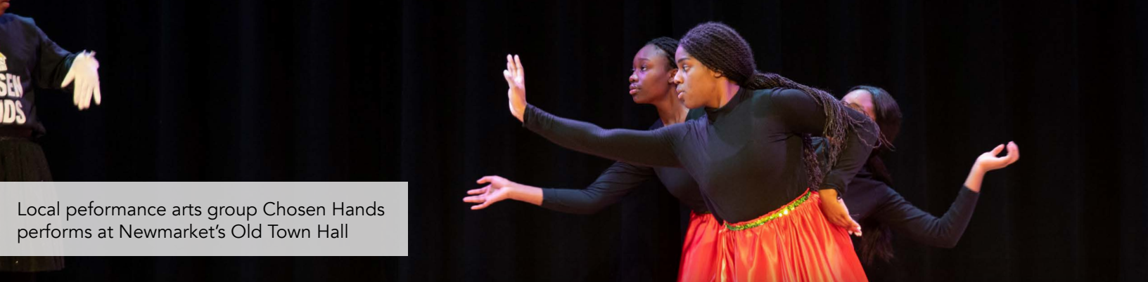
Local performance arts group Chosen Hands performs at Newmarket's Old Town Hall