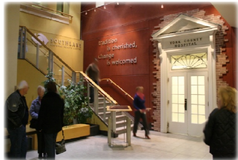
Original doors of York County Hospital are currently displayed in the main building of Southlake.