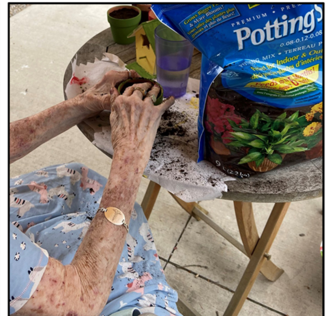
Resident at Margaret Bahen Hospice enjoying some time outdoors while painting a birdhouse and gardening.