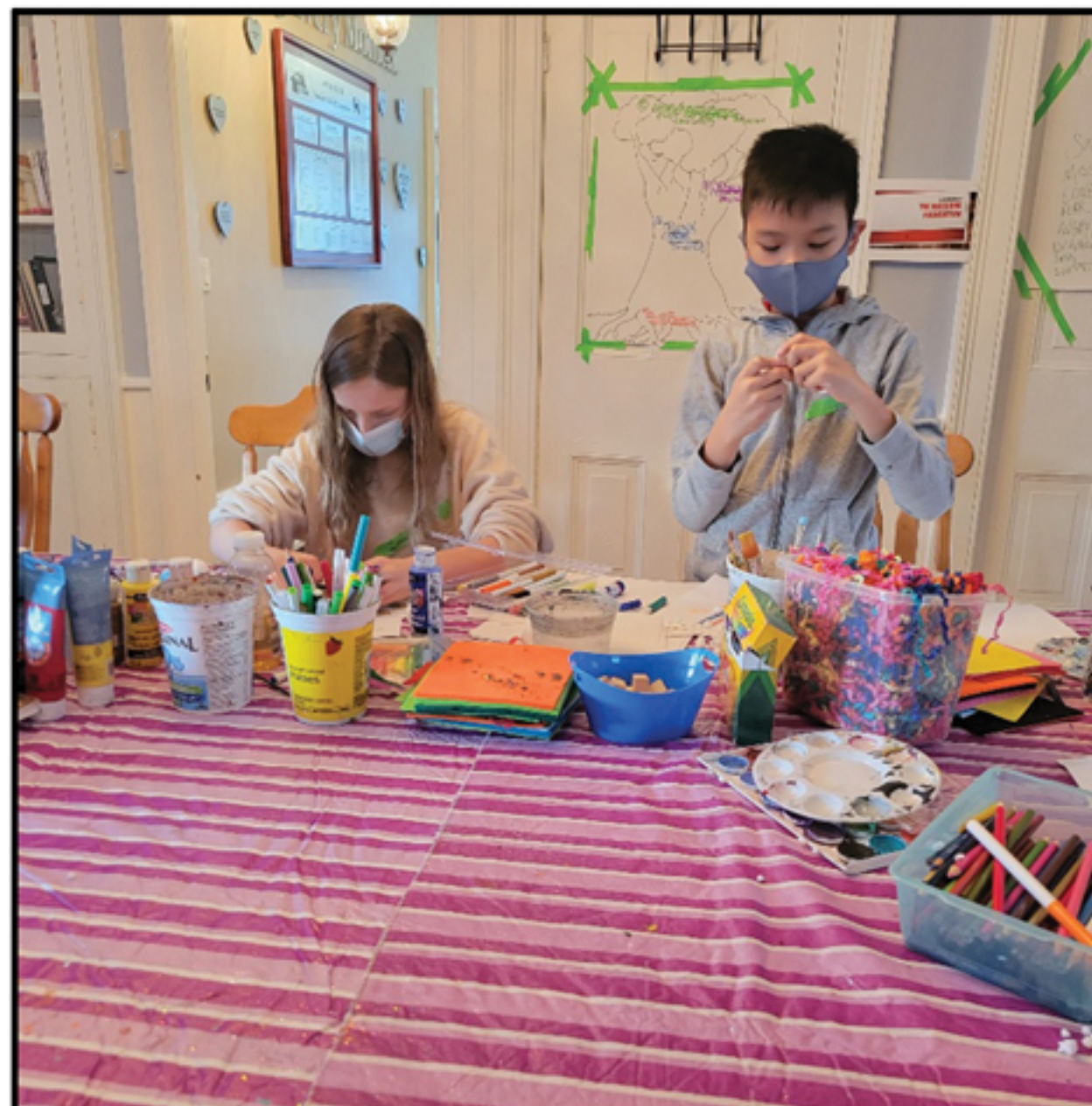
Participants creating artwork during a children's grief workshop, Under the Maple Tree, at Doane House Hospice.