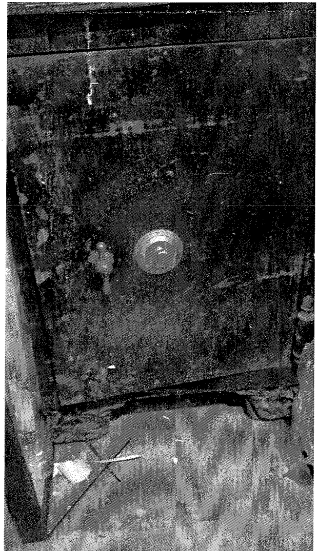
Outside of the Goldie & McCulloch safe