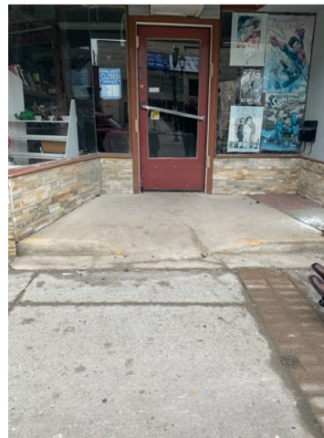
Comic Book Shop