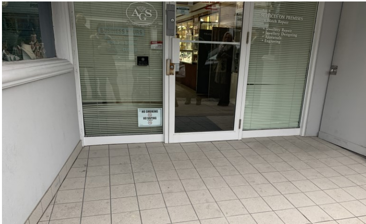
Knappett (requires automatic door opener)

Business that meet the AODA Requirements