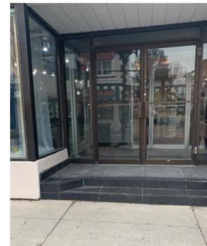
The Hair Company