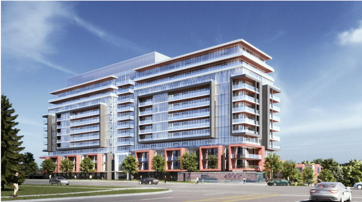
Figure 2: North – East Facing Rendering