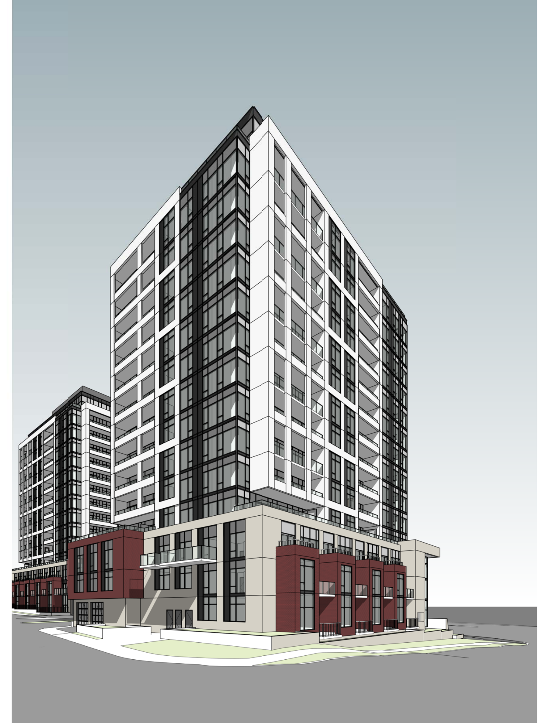
A-NW Corner at Driveway 1 SCALE: A0 11

Kohn Partnership Architects Inc. 116 Spadina Avenue, Suite 501, Toronto ON M5V 2K6 Tel 416.703.6700 www.kohnarchitects.com