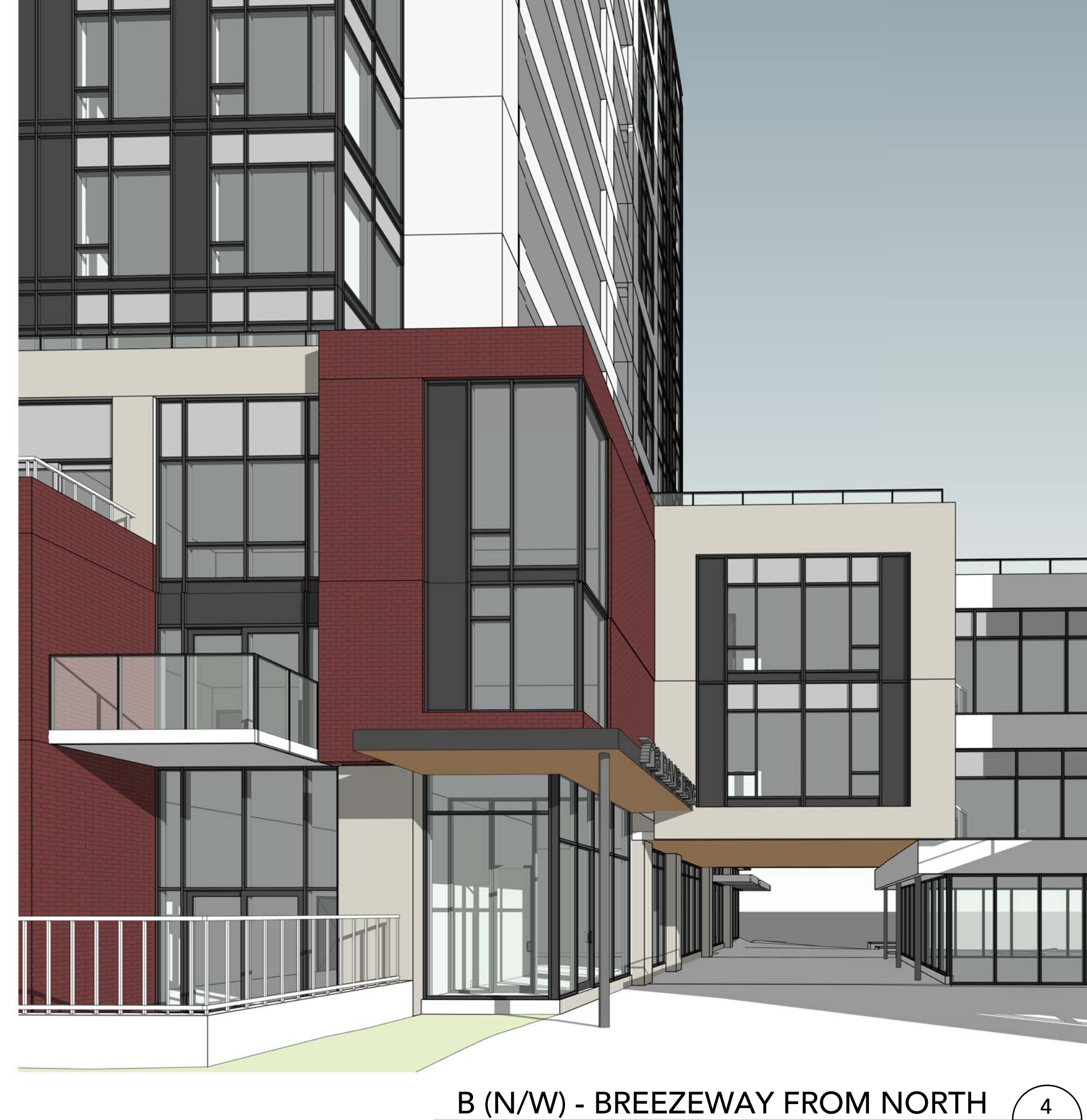
B (N/W) - BREEZEWAY FROM NORTH SCALE: 4012