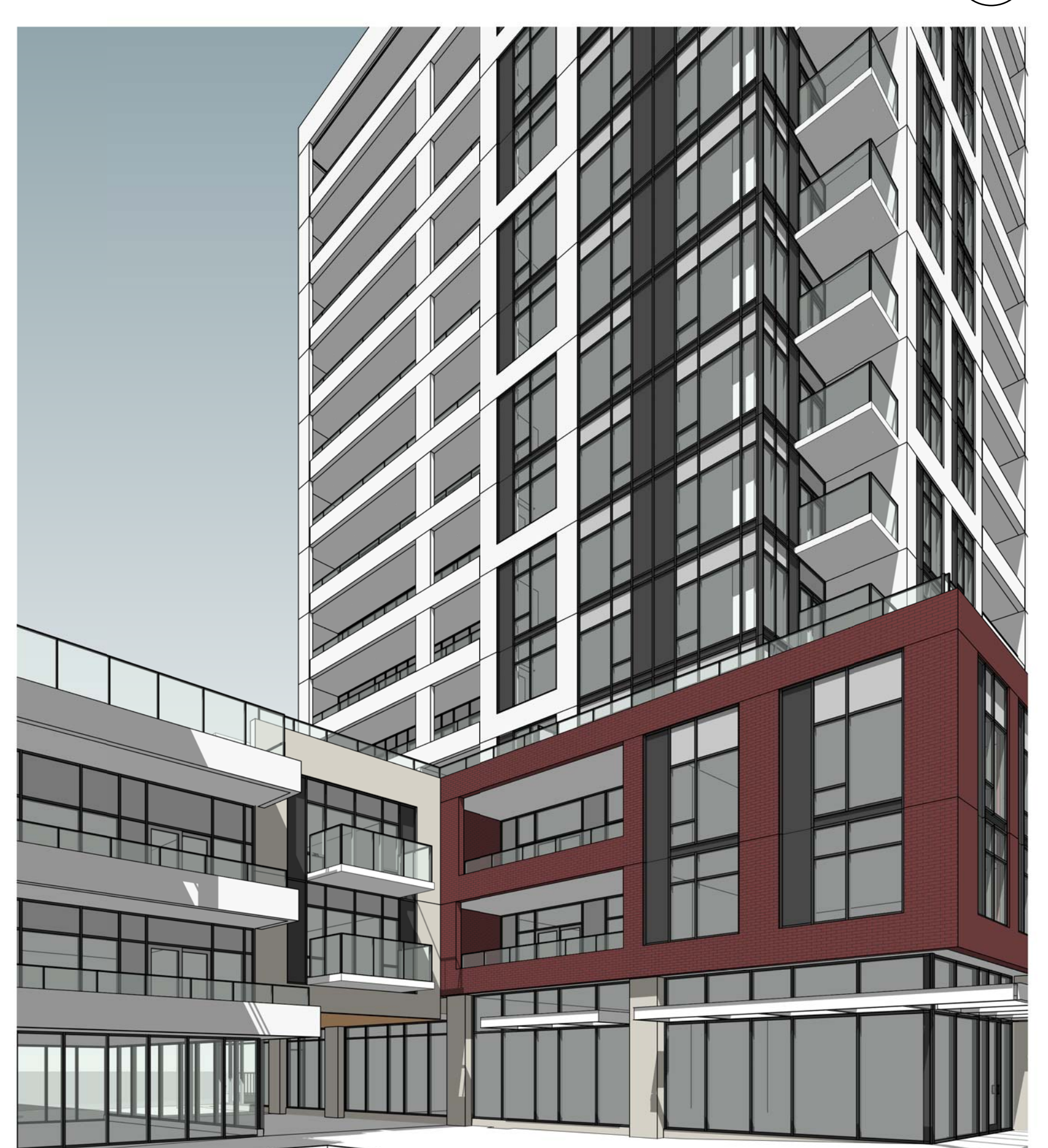
B (S/W) - BREEZEWAY FROM URBAN PLAZA 3 SCALE: A0 12