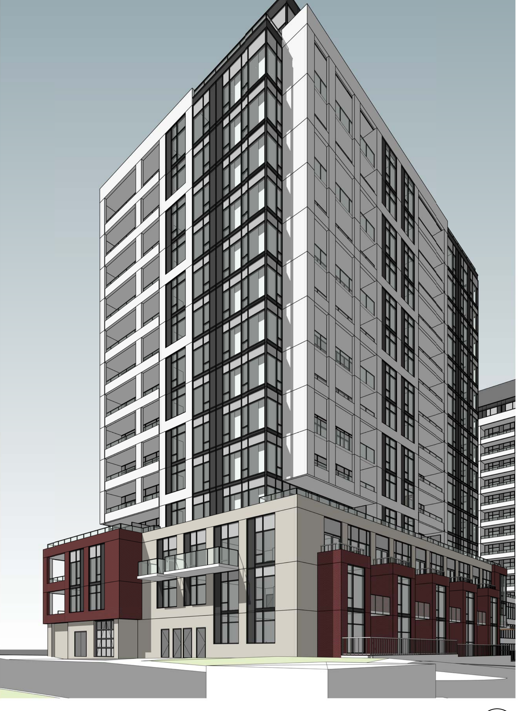
B-NE Corner 1 SCALE: A0 12