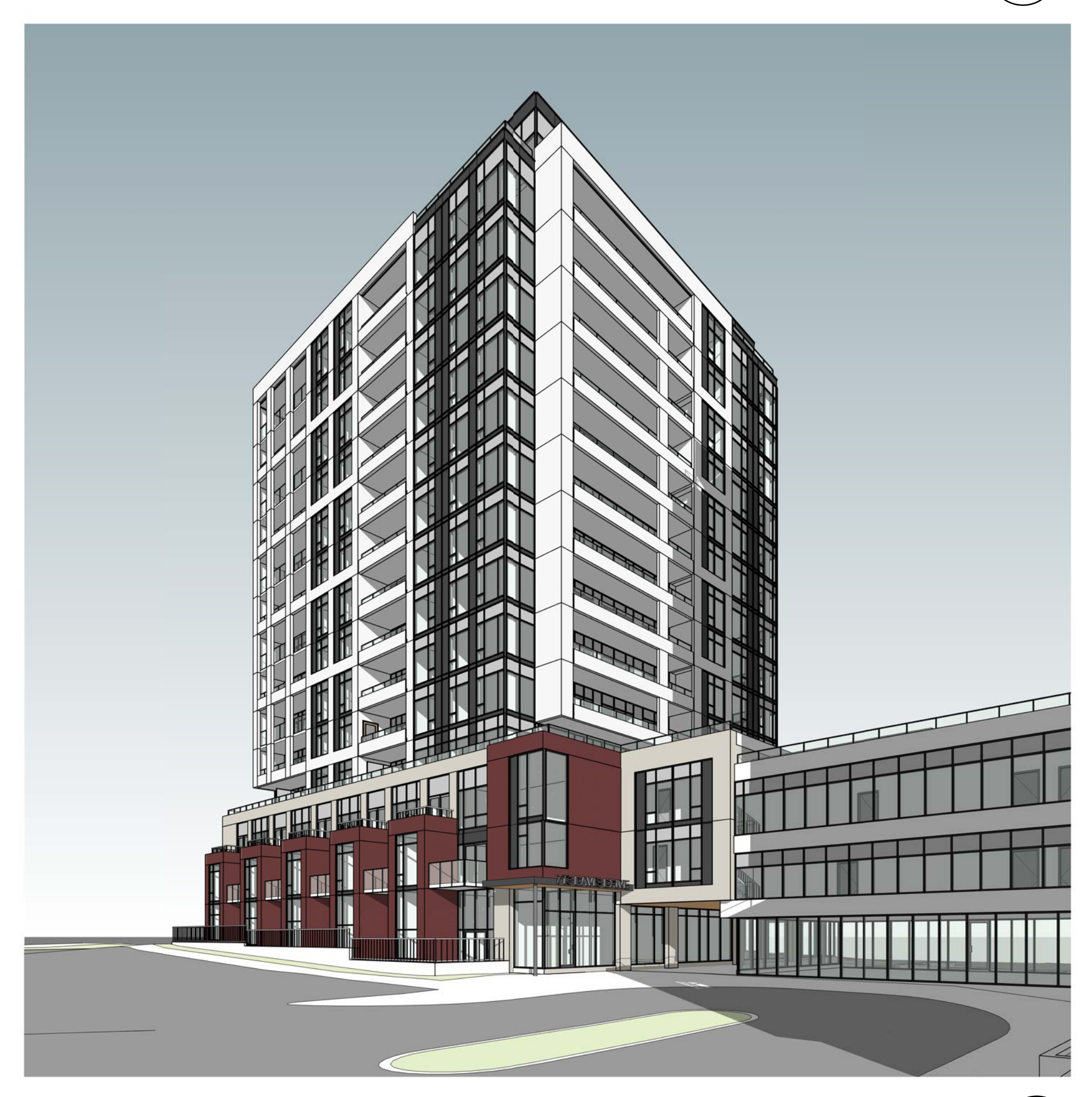
B (N/W) - RESIDENTIAL ENTRANCE 2 SCALE: A0 12