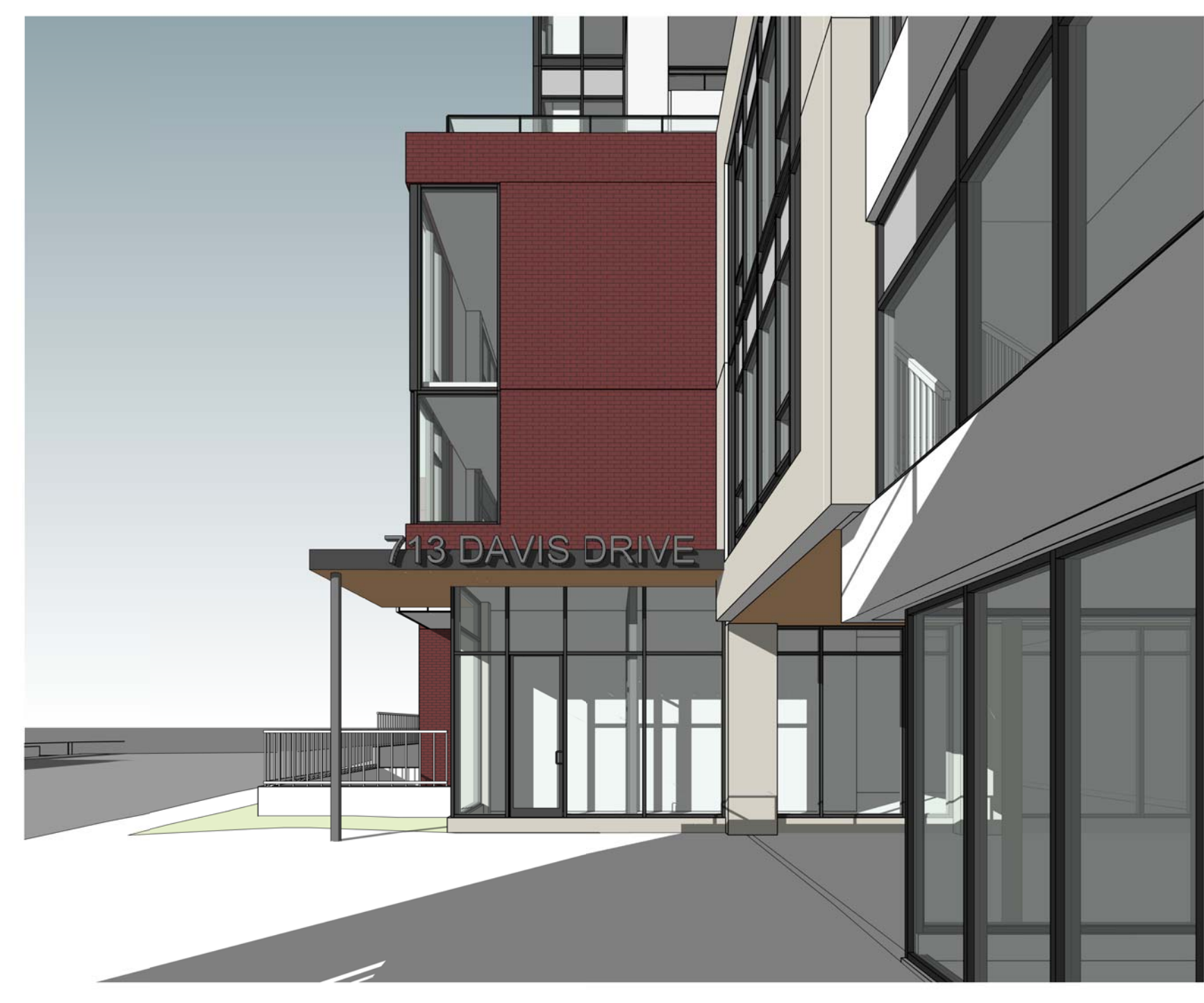
B (N) - RESIDENTIAL ENTRANCE 6 SCALE: A0 12