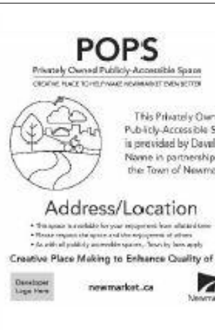
TOWN OF NEWMARKET SITE SIGNAGE SCALE: 1:1 A100