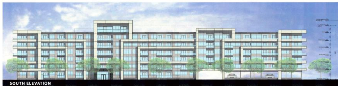
SOUTH COLOURED ELEVATION (DAVIS DRIVE) SCALE: 1:100