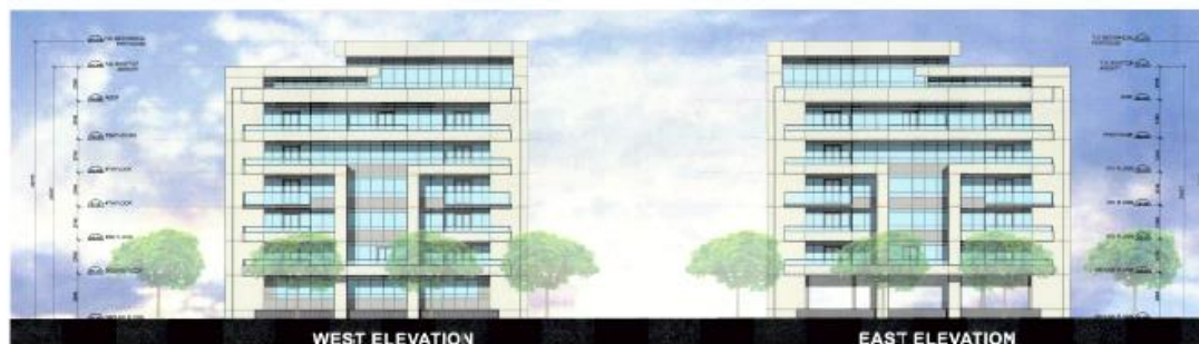
EAST AND WEST COLOURED ELEVATIONS SCALE: 1:100