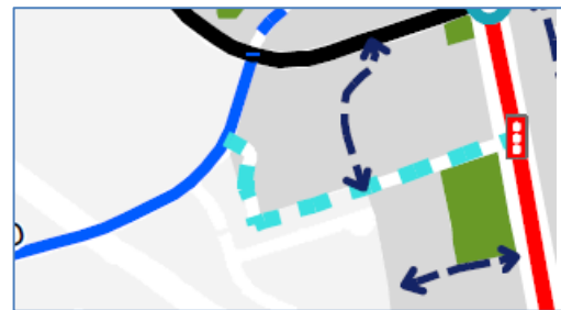
Figure 3 - Secondary Plan's "Future Local Road" in light blue

The Urban Centres Secondary Plan shows the area of the Proposed Trail as being a "Future Local Road". With this land secured by the Town, this area could be expanded over the long term into a full road, including active transportation accommodations. Additional land required for this road would be secured through the redevelopment of the abutting property to the north.