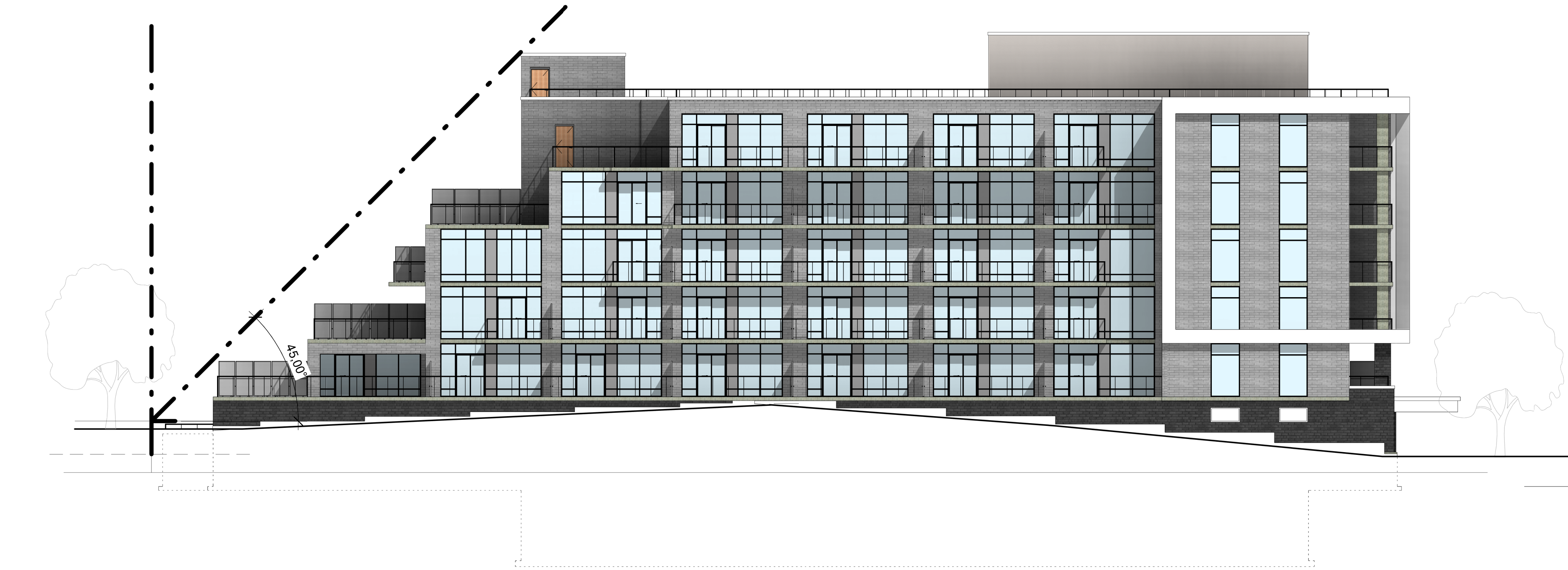
1 West Elevation- Colored 1 : 150