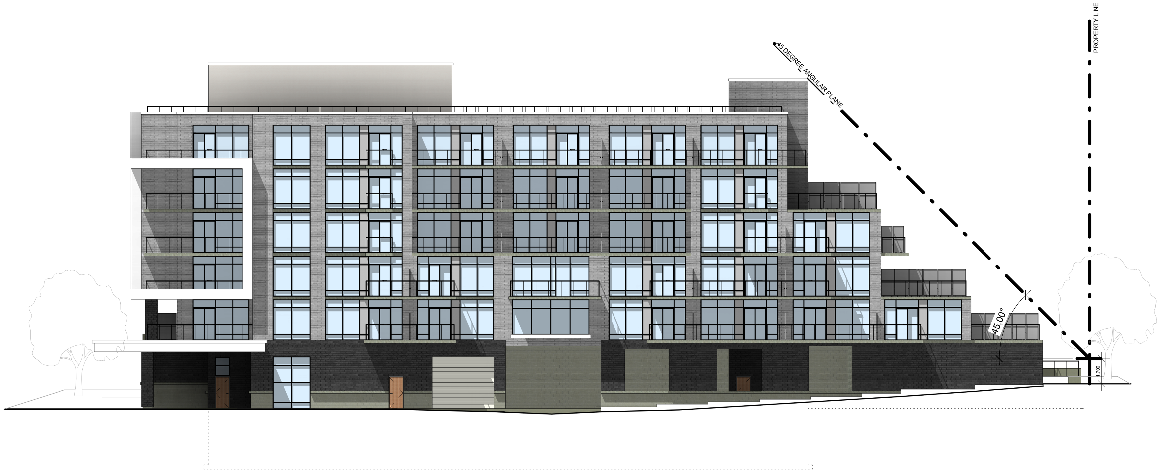
2 East Elevation - Colored 1 : 150

ISSUED FOR: REVIEW DRAWINGS "REVIEW" ARE NOT TO BE USED FOR PERMIT APPLICATIONS OR CONSTRUCTION UNTIL SO AUTHORIZED BY THE CONSULTANT.