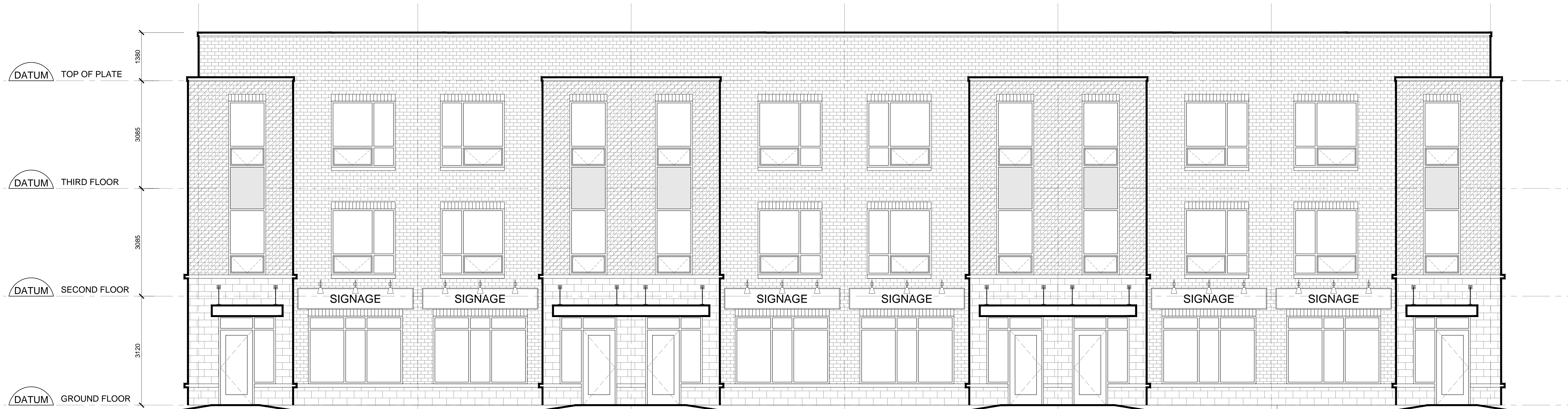
2 LIVE/WORK : FRONT ELEVATION A406 SCALE: 1:50