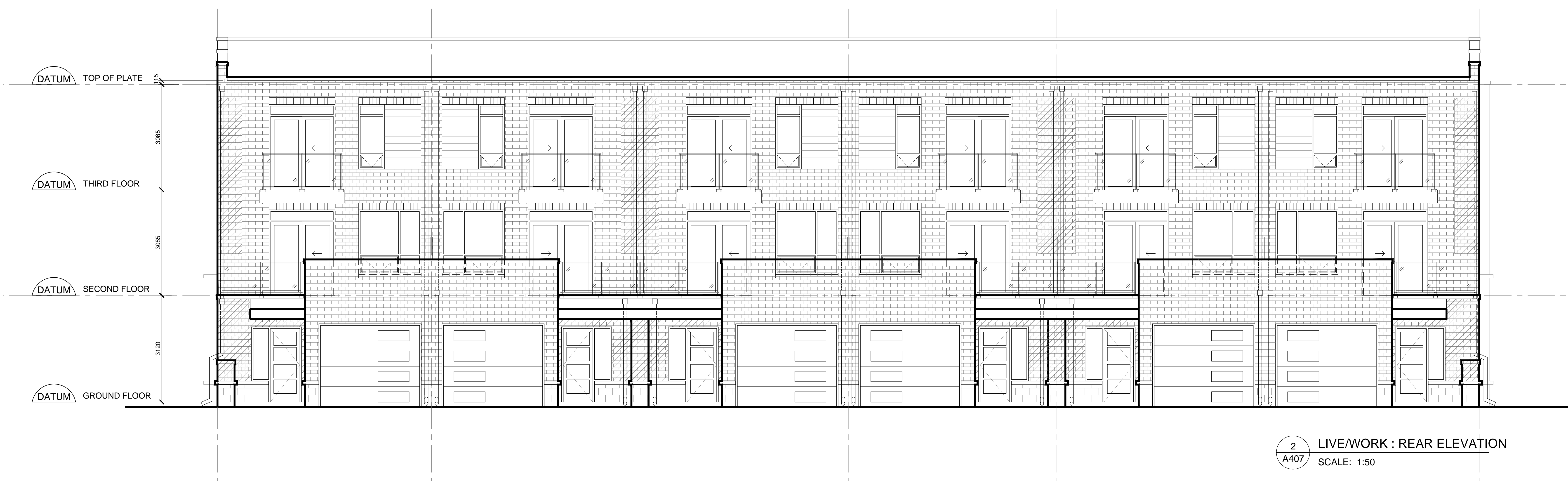
2 LIVE/WORK : REAR ELEVATION A407 SCALE: 1:50