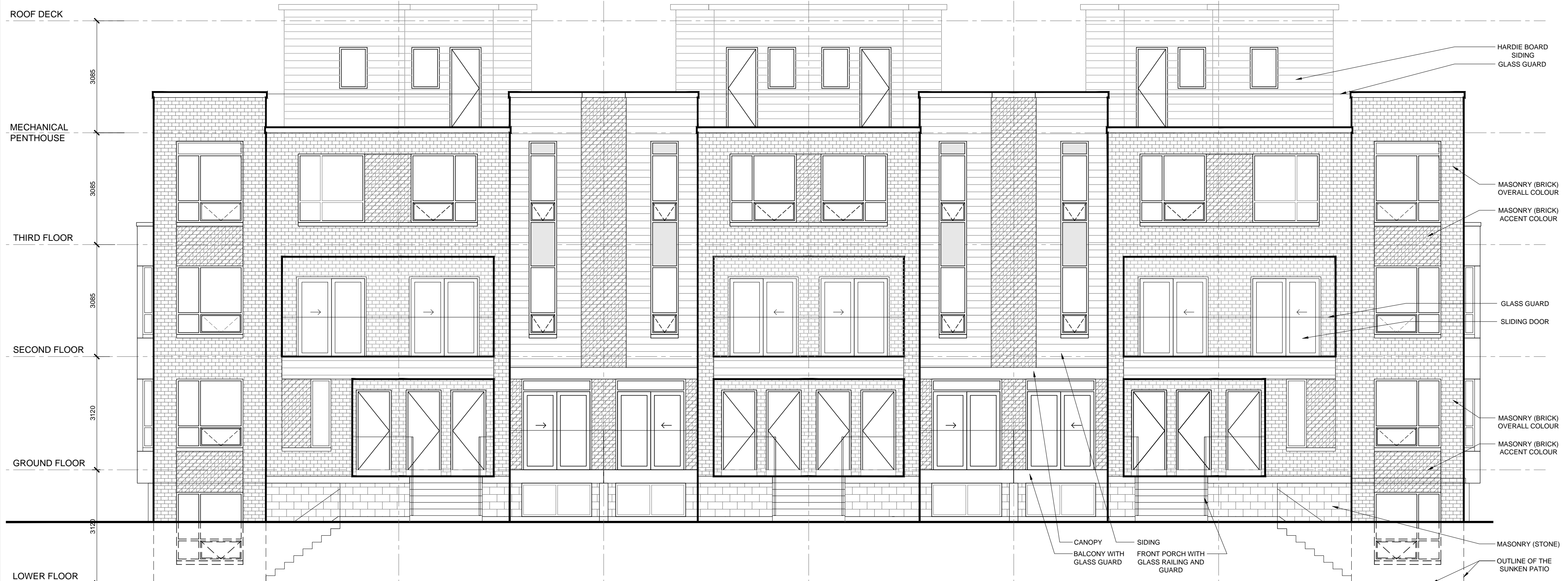
3 REAR ELEVATION - BLOCKS 3, 4, 6, 11 AND 12 A400 SCALE: 1:75