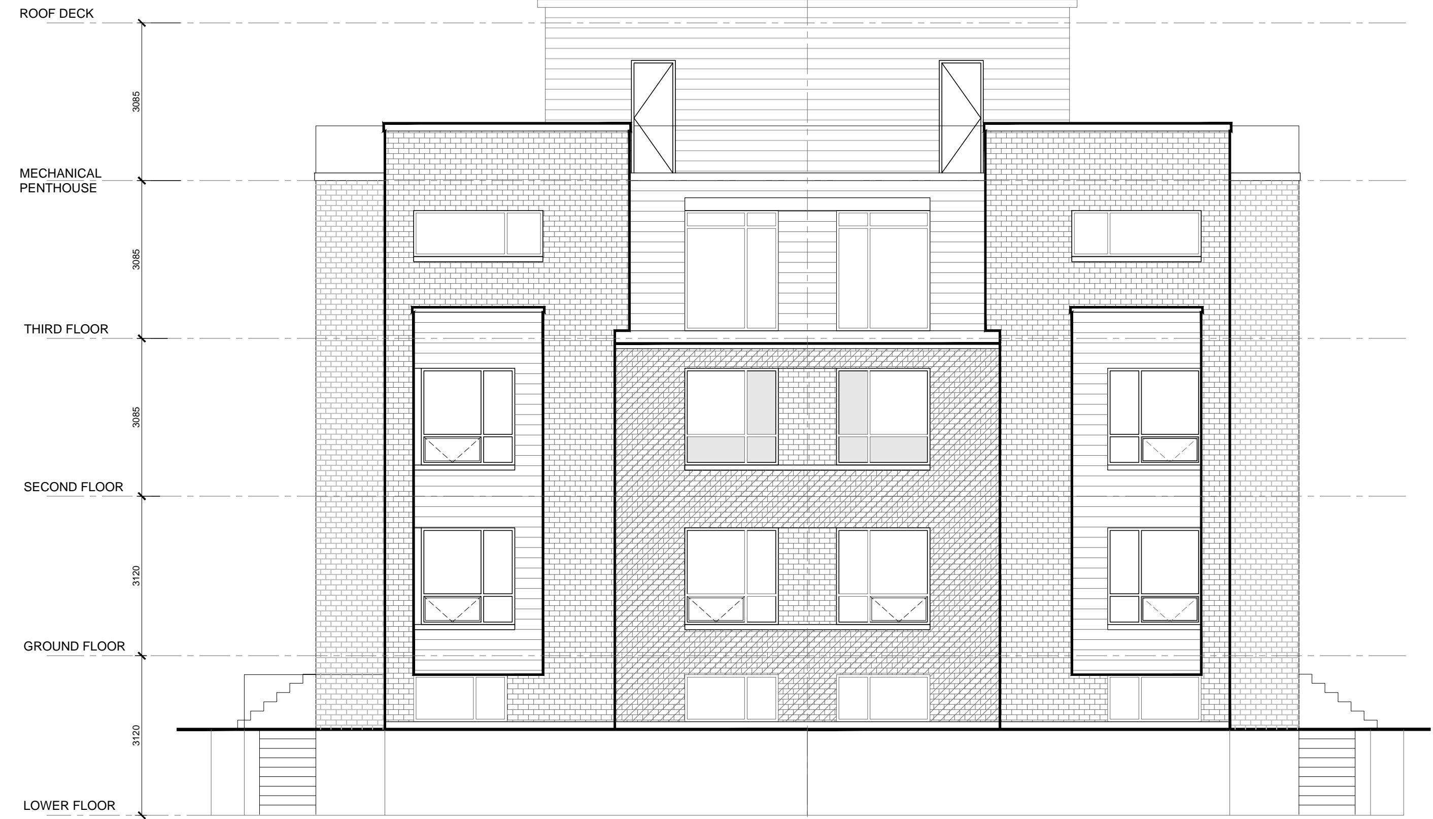
2 SIDE ELEVATION - BLOCKS 3, 4, 6, 11 AND 12 A400 SCALE: 1:75