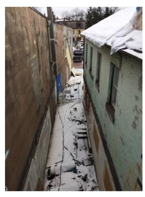
Photo 3: 192 Main Street, between 194 Main Street (left) & 190 Main Street (right)

The proposed work on this property consists of rebuilding the single storey commercial building between the two larger abutting properties, with a new supporting wall abutting 194 Main Street to the south. Although a single storey in height, a false second storey façade (with window) is approved to be constructed in order to create the consistent 2-storey appearance from the street. The false window is to be placed at the same height as the windows in the abutting buildings, and the overall architecture of the