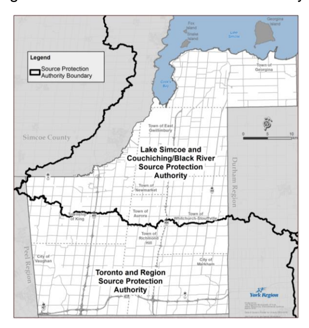
Figure 1: York Region's Two-Source Protection Authorities

Another governing body, known as the Source Protection Authority (SPA), is in place to lay out the groundwork for the source protection process. Figure 1 is a map of the SPAs in the Region. The Town of Newmarket, in particular, is under the jurisdiction of the Lake Simcoe and Couchiching/Black River Source Protection Authority.