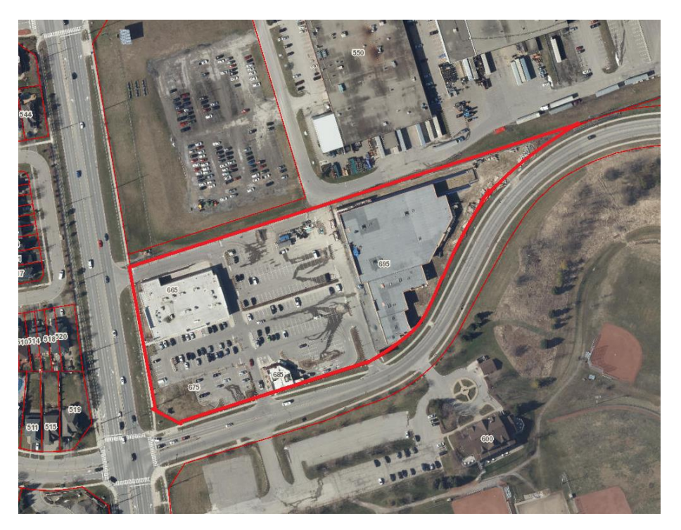
Figure 1: Subject Lands

The proposed zoning by-law amendment submitted by Groundswell Urban Planners Inc. on behalf of the owner, Garden Commercial (Newmarket) Inc., concerns a 2.49 hectare property located on the northeast corner of Bayview Avenue and Stonehaven Avenue. The subject lands are irregularly-shaped, with a taper to the east as Stonehaven Avenue curves northward. The site has been developed as a retail commercial plaza with four buildings. The buildings are currently occupied by a Shoppers Drug Mart on the northwest corner, a Tim Horton's with a drive through on the south of the site, and the large building on the east of the site that is occupied by a grocery store. Figure one provides an aerial view of the site below, although the building at the southwest corner has now also been constructed.