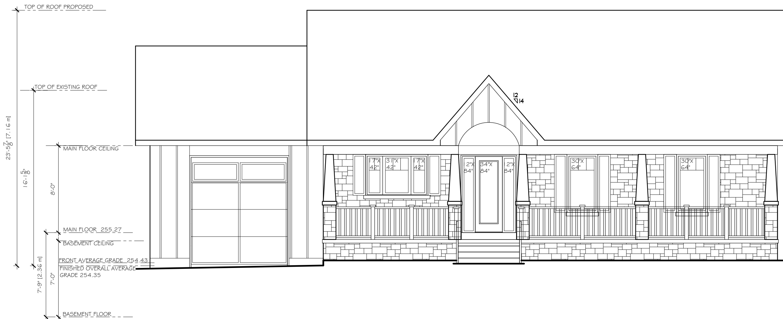
1 EAST (FRONT) ELEVATION Scale: 3/16" = 1'-0"