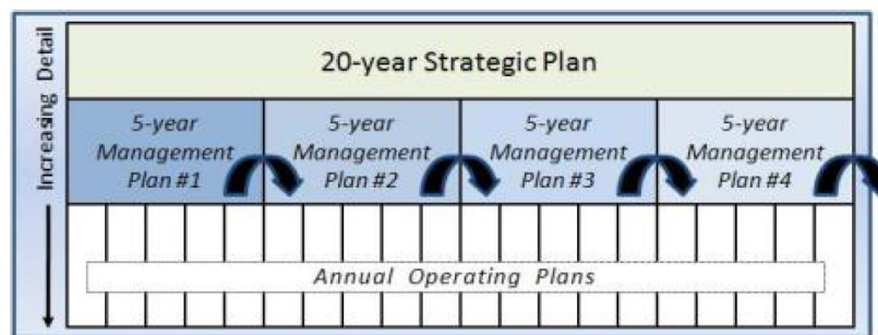
Figure 1: The strategic planning temporal and structural framework.

The Town of Newmarket Urban Forestry Management Plan is a goal-oriented document with a focus on actions and achievable outcomes. This Plan is organized into long term guiding principles (20 years) and more immediate goals (5 years). Yearly operational plans will be created to implement the 5 year goals. From York Region's Strategic Urban Forest Management Planning Toolkit, this proposed planning framework is outlined graphically below: