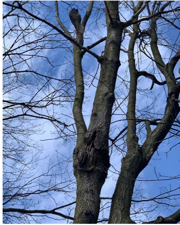
Cytospora fungus canker is damaging Sugar Maples