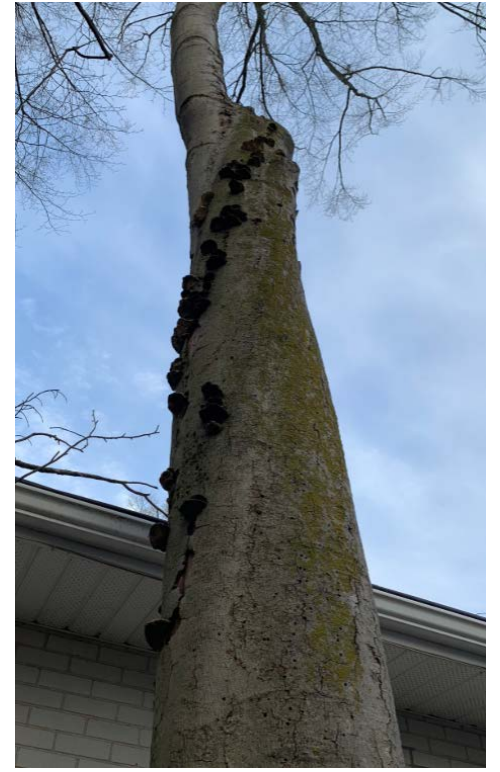
Beech scale and bark disease are wiping out Beeches