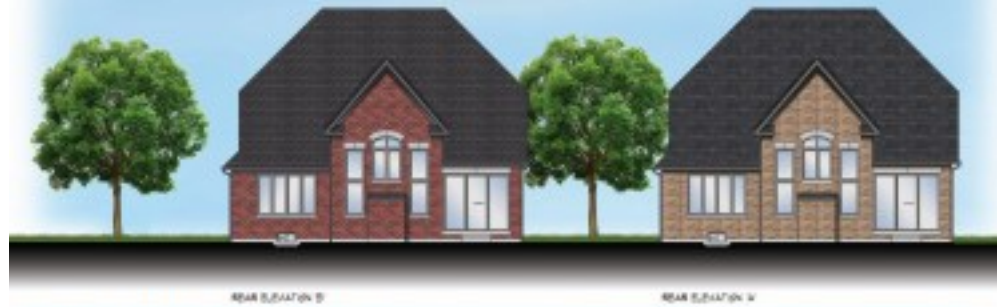
MODEL 3 - REARS