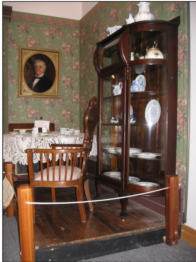
Wm. Roe Display

To collect, preserve, research, and interpret the heritage of Newmarket for the education and enjoyment of the public.