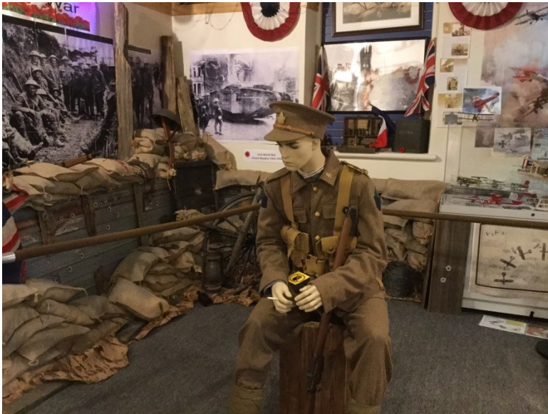
First World War Display carried over one year due to popular demand