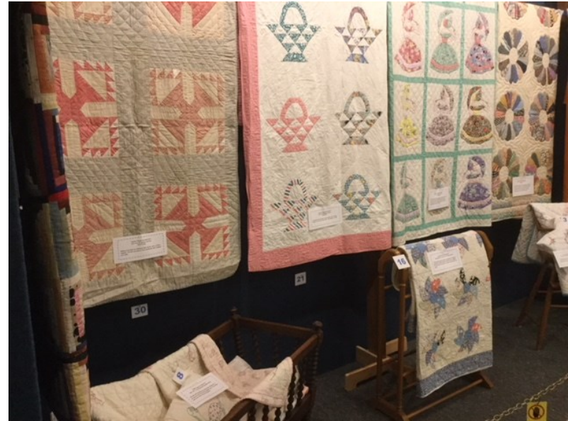
Warmth Through the Generations Quilt Display Museum collection and Community Partnership