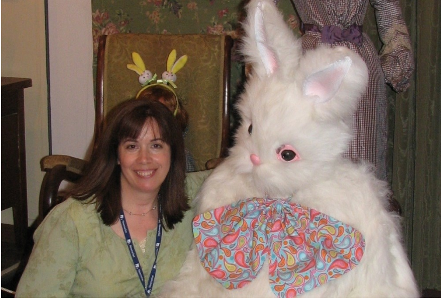
Eggceptional Easter Fun Approx. 75 participants this year