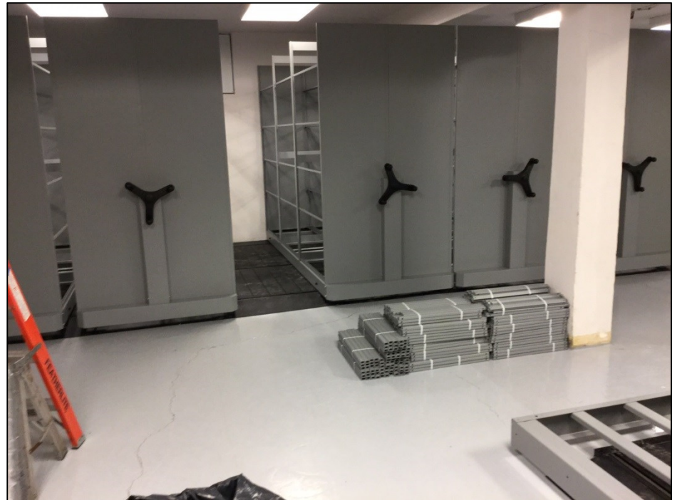
New storage system