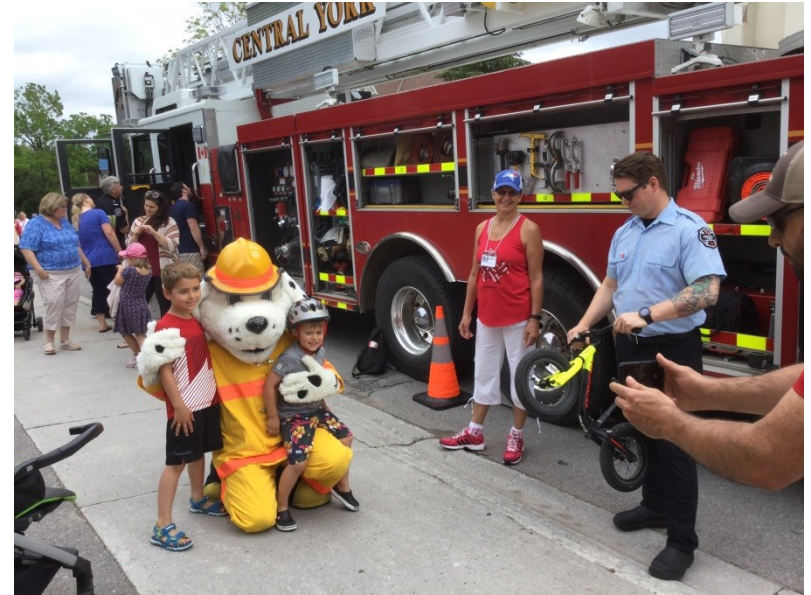
Canada Day Open House at the Museum with CYFS drew over 2,000 visitors last year!