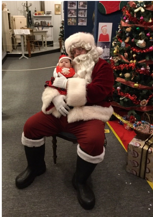
Cocoa and Cookies with Santa

To make awareness and appreciation of local heritage an integral part of the community's life by offering excellent service and quality programmes.