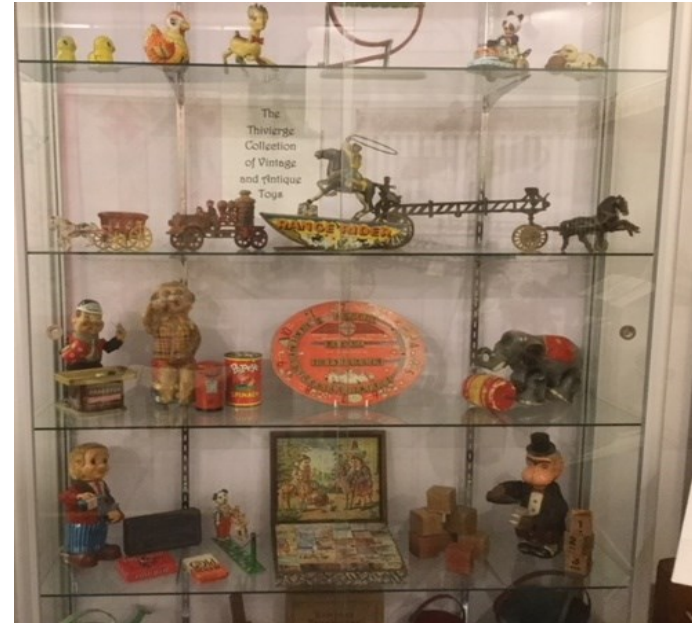
Thivierge Vintage and Antique Toy Collection featuring toys from c.1800s-1900s