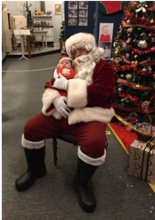
Cocoa and Cookies with Santa

To make awareness and appreciation of local heritage an integral part of the community's life by offering excellent service and quality programmes.