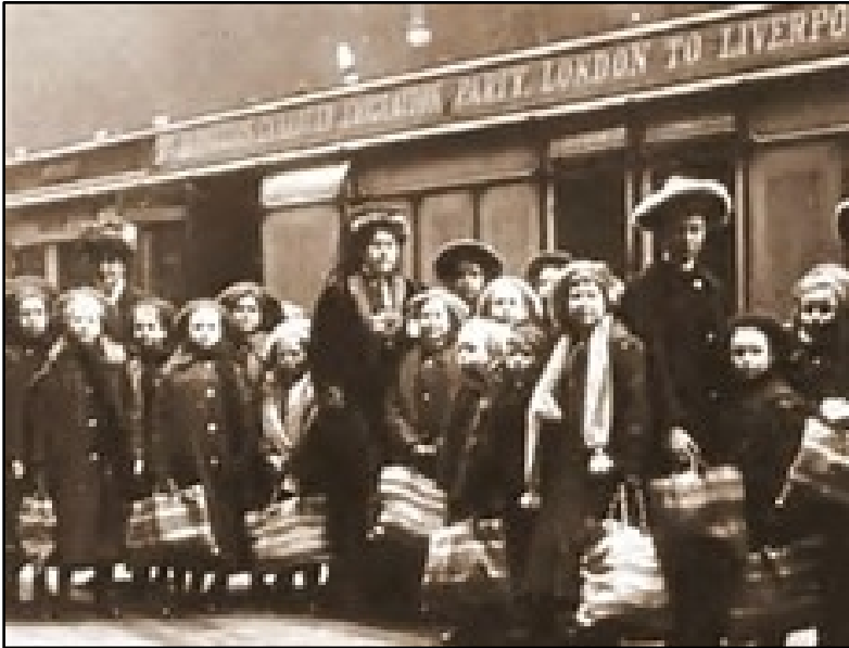
British Home Children Exhibit, partnered with the Old Town Hall!