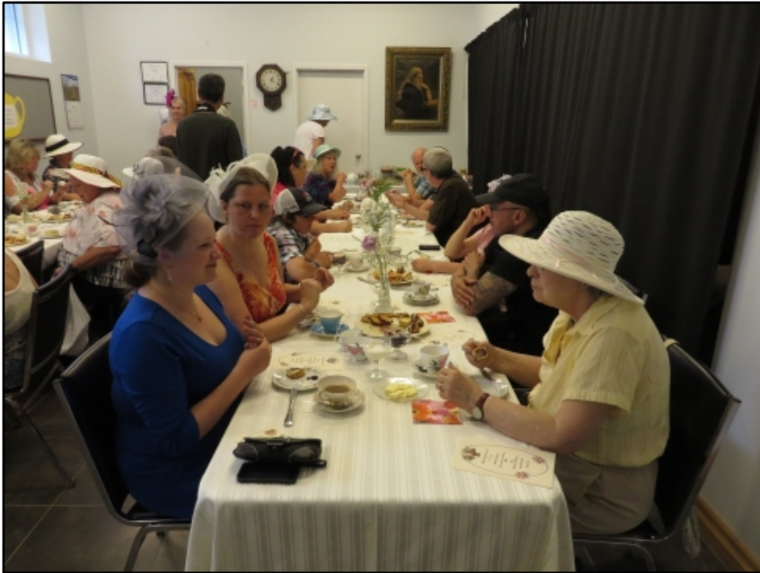
Mother's Day Tea. Sold out!