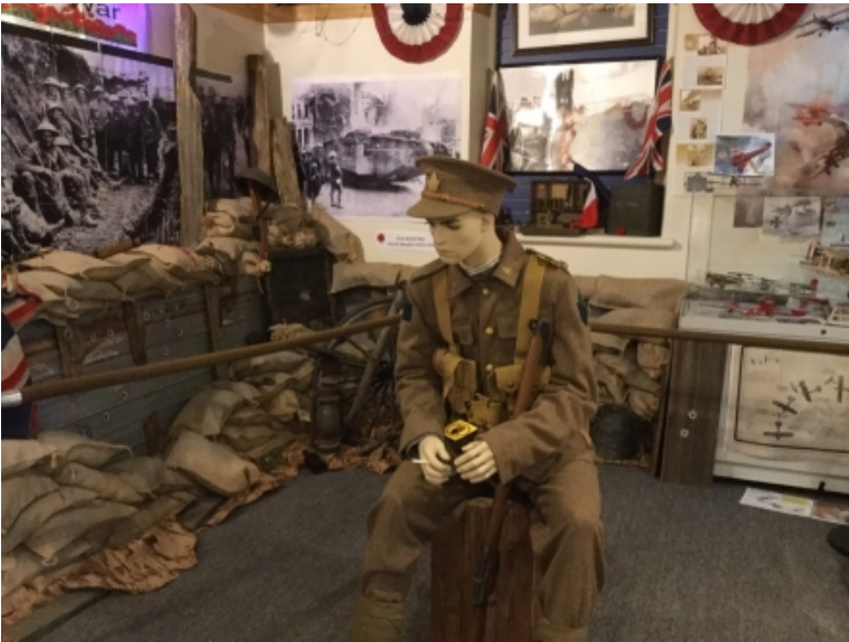
First World War Display