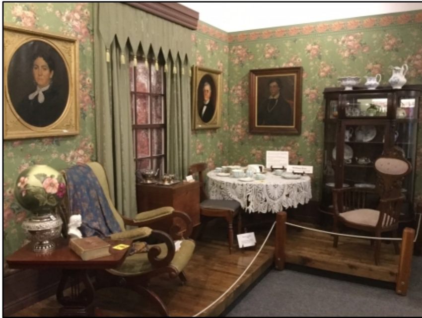
Wm. Roe Display

To collect, preserve, research, and interpret the heritage of Newmarket for the education and enjoyment of the public.