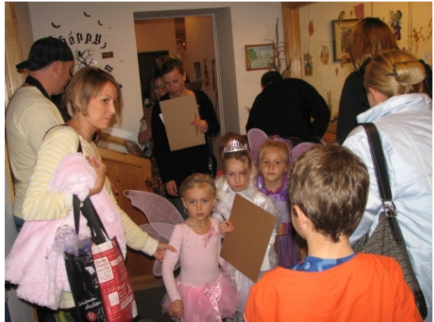
Spooktacular Halloween Party