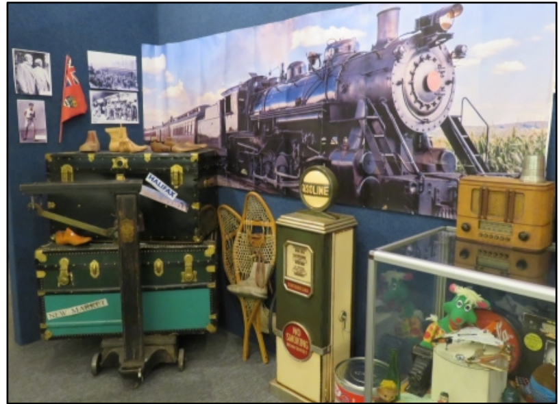
Canada 150: Do You Remember?