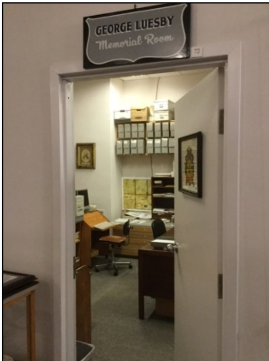
George Luesby Memorial Room and Archives