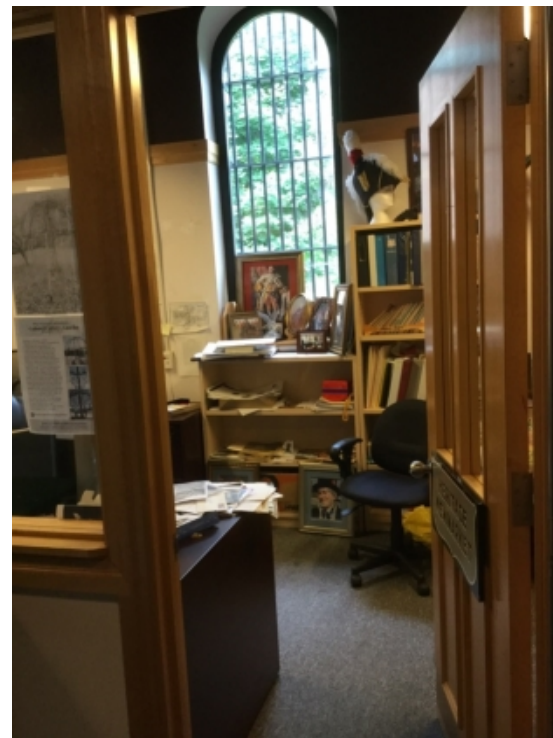
Heritage Newmarket Office