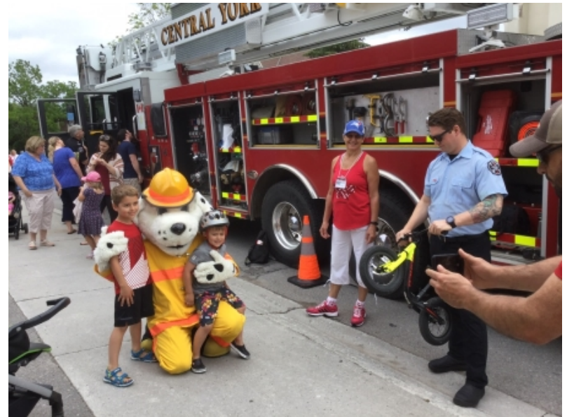
Canada Day Open House at the Museum with CYFS drew over 2,000 visitors!