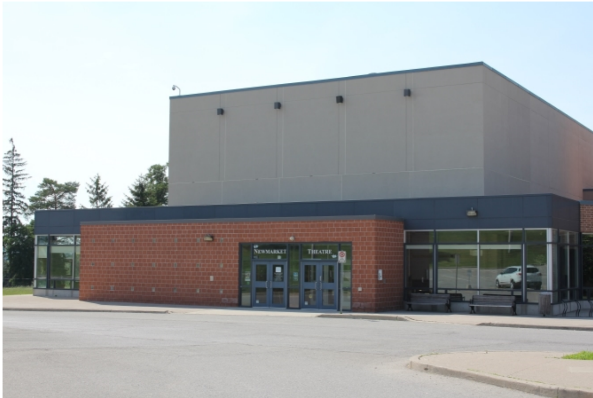
Newmarket Theatre Completed: June 8, 2017