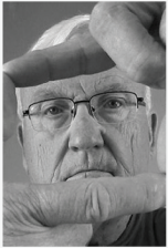
BRIAN STEEVES PHOTOGRAPHER & VIDEOGRAPHER